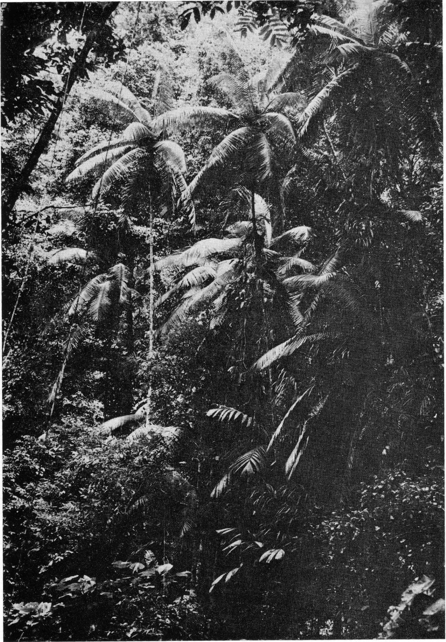
4. Rhopaloblaste elegans at the headwaters of the Matinikau River near Honiara on Guadalcanal.