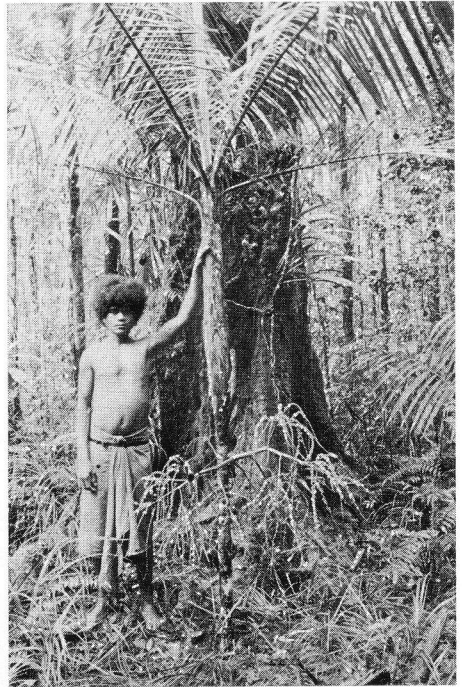
3. Rhopaloblaste Brassii ( Brass 7145 ). Note the slender stem, spreading pinnae, and twice-branched, sharply divaricate lower branches of the inflorescence. Photo by L. J. Brass.

None of the collections cited is complete and most are not truly comparable, being in various stages of flower and fruit, yet correspondence is sufficient so that I consider them to represent the same species. The type has mature fruit, Brass 13809 has immature fruit, Kanehira & Hatusima 12131 has pistillate buds, Darbyshire & Hoogland 8373 has a portion of inflorescence in very young bud, Brass 7135 and 7135A have staminate flowers, pistillate buds, and unripe fruit which measures less than that in the type but more than that described for R.