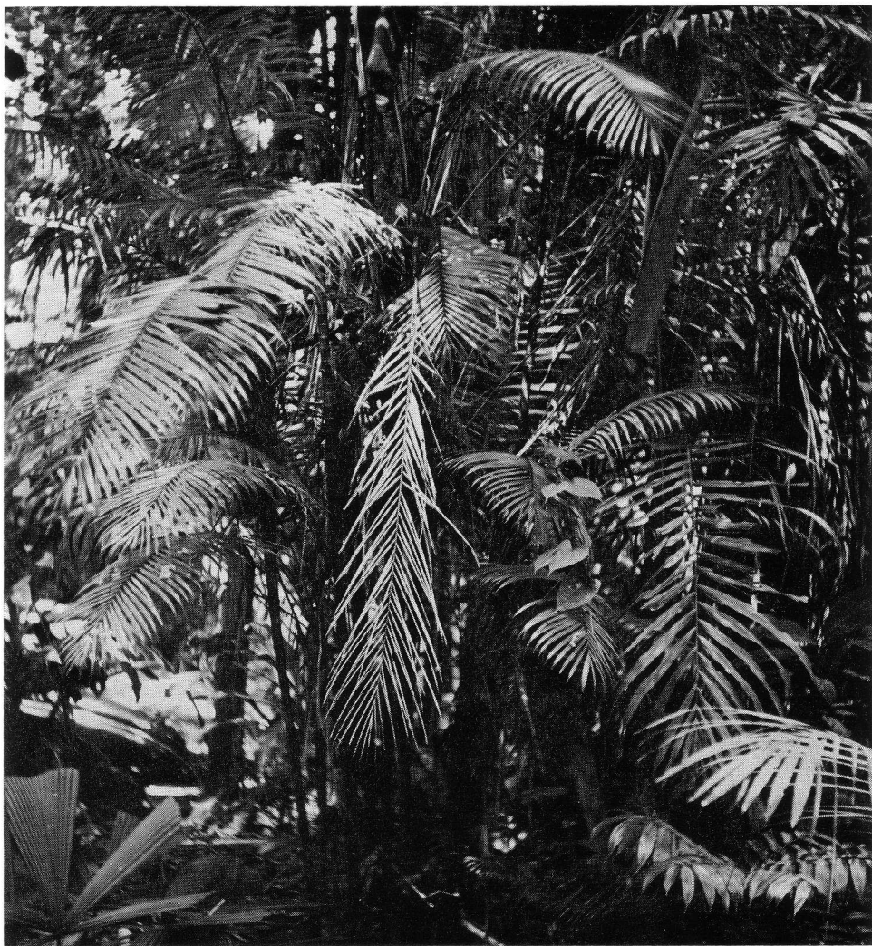
6. Rhopaloblaste singaporensis forms clumps in the Singapore Botanic Garden.

Fruit orange-yellow to red, 13–14 mm. high including prominent beak 2 mm. high, 9–10 mm. in diam.; endocarp about 11 mm. long, 8 mm. in diam., prominently impressed over the hilum, operculum round, hilum impressed in the seed the length of one side.