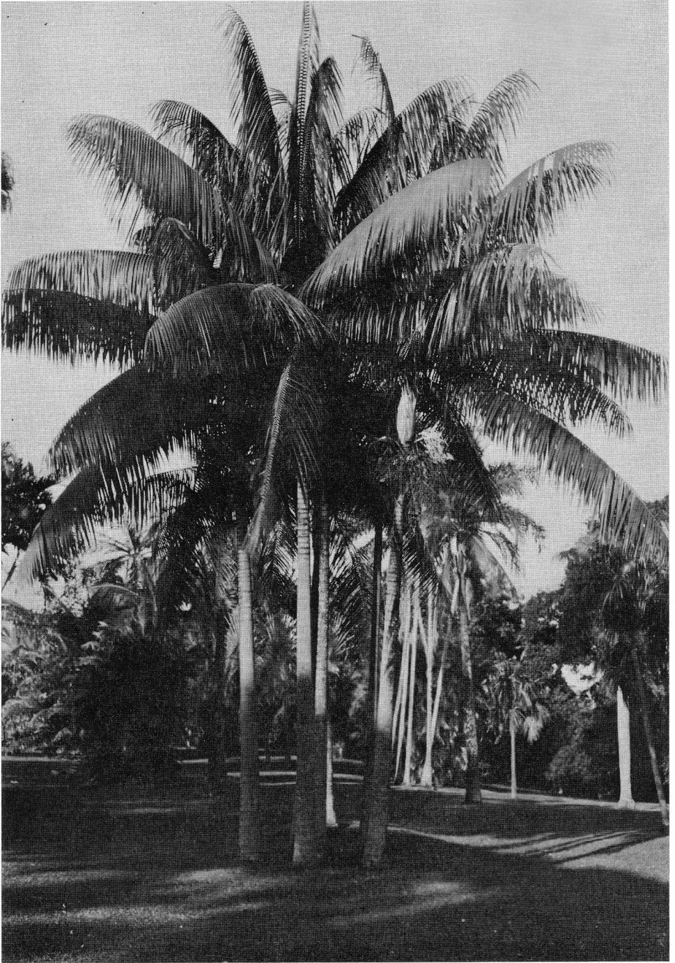
2. Rhopaloblaste augusta growing in the Botanic Gardens at Roseau, Dominica (Bailey 711).