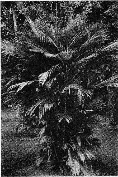
12. An unidentified species of Paralinospadix from the Milne Bay District (accession S 1990).