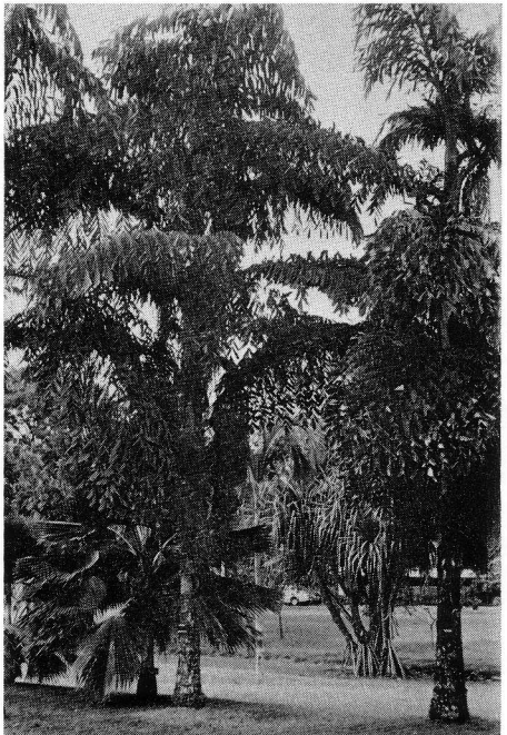
10. Caryota urens in flower and fruit.