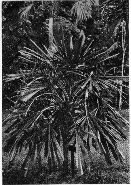
13. New Britain is the home of this Licuala species.

Arecastrum romanzoffianum (Cham.) Becc.—P 37, 107 Arenga microcarpa Becc.—S1248, S702: in native rainforest A. obtusifolia Mart.—S2317: X