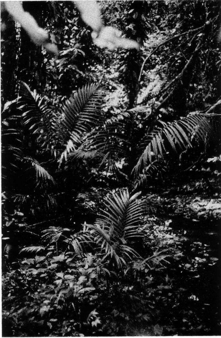
5. Young plants of Gulubia costata come up spontaneously in the native rainforest area.