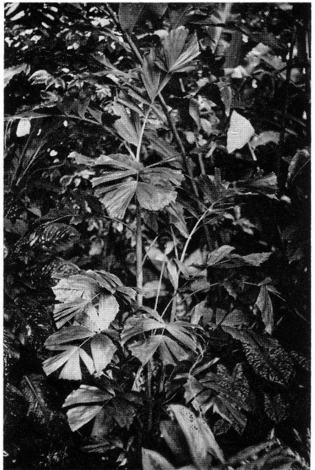
18. Nengella species grows in the shady border.