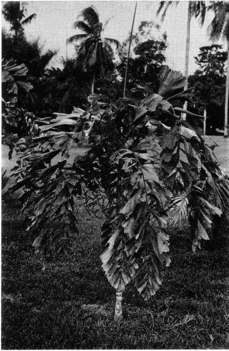
15. An undescribed Dryophloeus from New Britain.