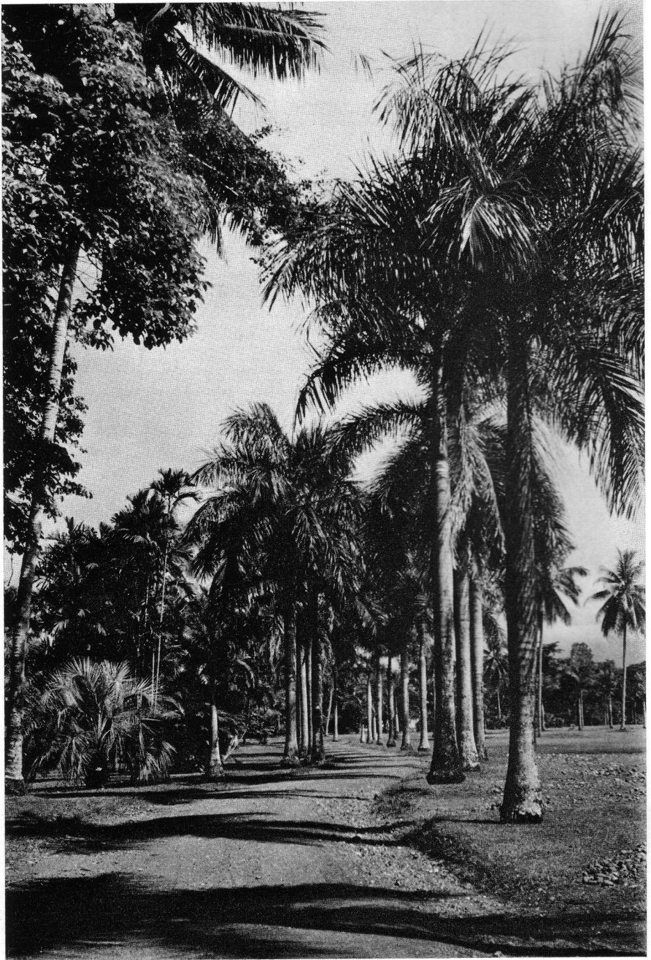
1. The road that winds through the palmetum is lined with royal palms.