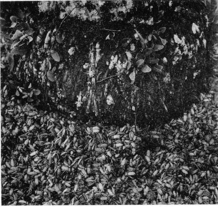
11. When Caryota flowers, the ground becomes carpeted with the fallen male flowers.

Arecastrum romanzoffianum (Cham.) Becc.—P 37, 107 Arenga microcarpa Becc.—S1248, S702: in native rainforest A. obtusifolia Mart.—S2317: X