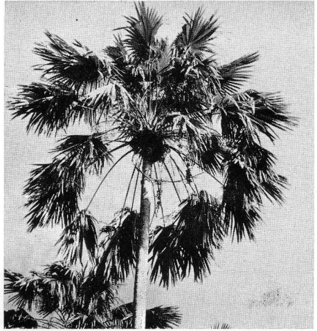
17. A close-up view of the crown of the Livistona in Figure 16.

A. tremula (Blanco) Becc.—S1526: P 179–183