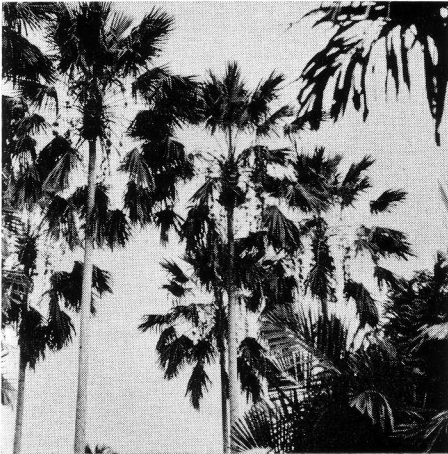
16. A fine stand of Livistona species bears bright red fruit (accession E 2022).

A. porphyrocarpa (Mart.) H. E. Moore—S2321: X