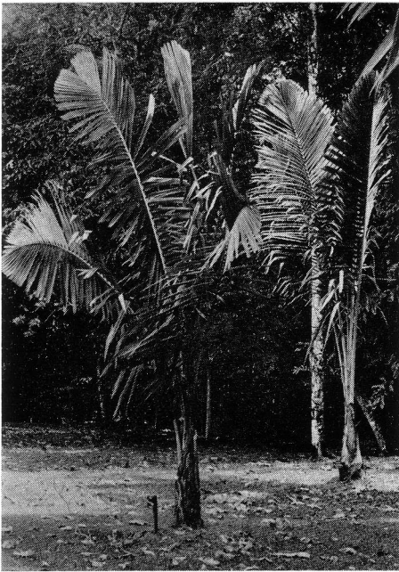
8. Young plants of Orania macropetala from seed collected by H. E. Moore in 1964.

A. spp. —E2008: P 272; E2019: P 221; S2004: P 168–70