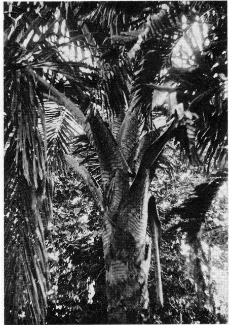
14. The leaf bases of Metroxylon salomonense are zebra-striped and prickly.