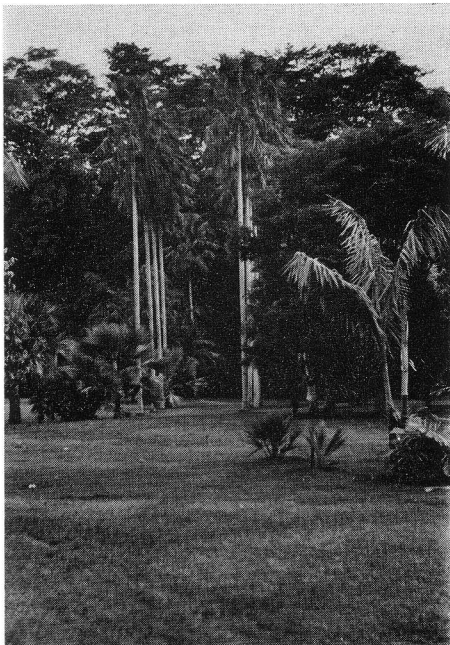
3. Part of the palmetum near the rainforest.

palms in the garden. As in any botanical garden open to the public, many labels have been lost or misplaced over the years. A number of the unlabeled palms are juvenile or currently sterile and