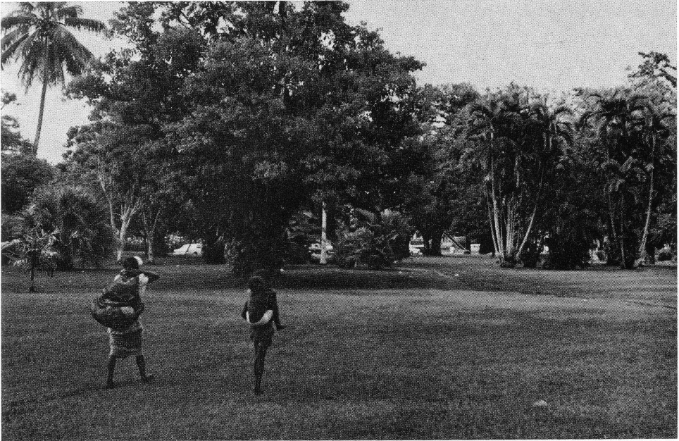
2. People return home from market via the botanic garden.