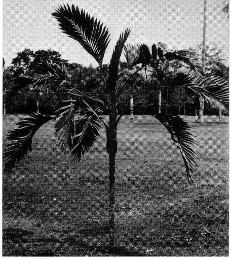
9. Heterospathe woodfordiana from the Solomon Islands.