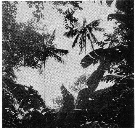
4. Two Gulubia costata poke through the rainforest vegetation at the edge of the palmetum.

palms in the garden. As in any botanical garden open to the public, many labels have been lost or misplaced over the years. A number of the unlabeled palms are juvenile or currently sterile and