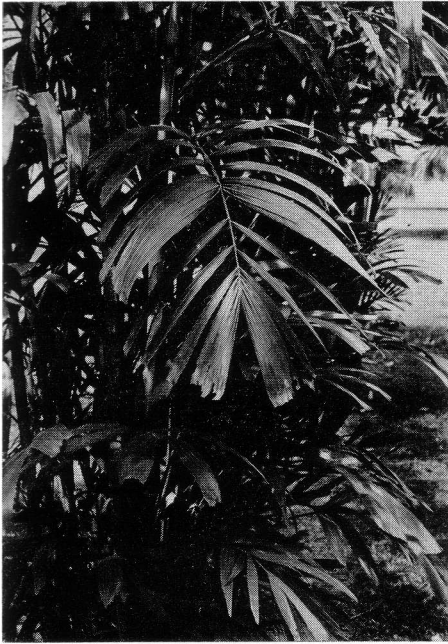
7. Hydriastele sp. has an unusual leaf arrangement.