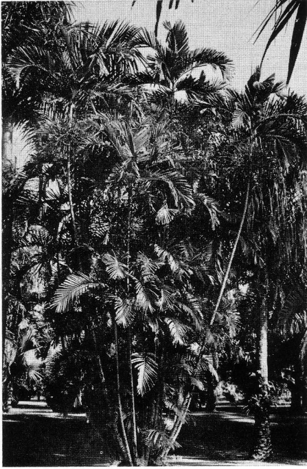
19. A typically large clump of a new species of Ptychosperma not yet described.