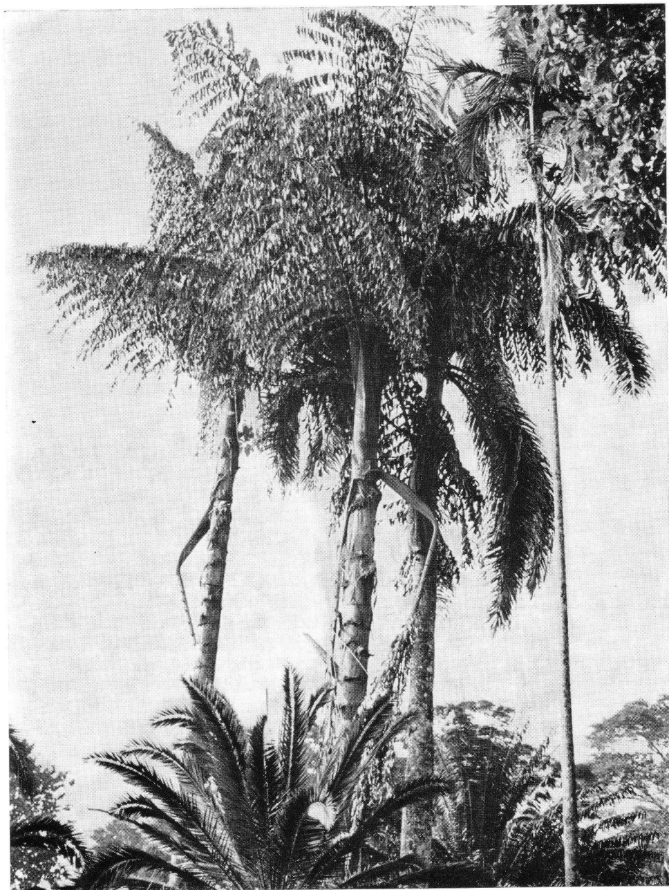
2. Caryota no in the Kebun Raya, Bogor, Indonesia, planted in 1957.