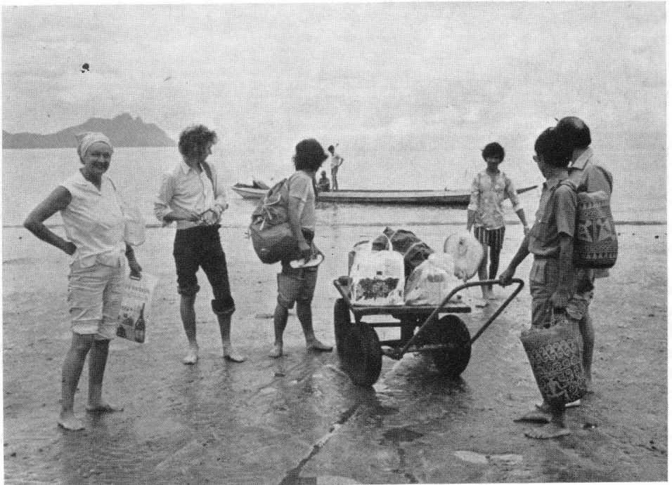
7. Disembarking at Bako.