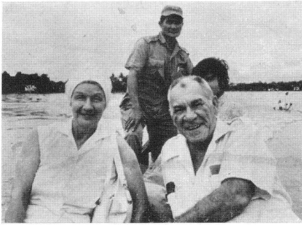
6. Down the Sarawak River to Bako National Park.

a large stalk of seeds (Fig. 5). Unfortunately they were immature.