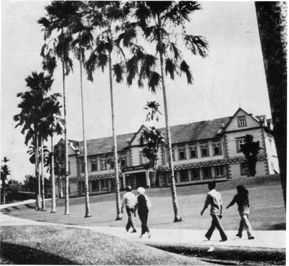
10. Livistonas enhance approach to the Sarawak Museum in Kuching.

hill and down, on both sides of the trail but weren't easy to photograph either individually or in depth (see Fig. 8). The entire party began searching for seeds, which meant probing the forest debris that collects around the base of this trunkless species of palm that fruits near the ground. Our efforts were in vain as we didn't find a single viable seed. Disappointing though it was, we thrilled at the sight of this beautiful and unusual palm and resolved to try again for seeds later on our itinerary.