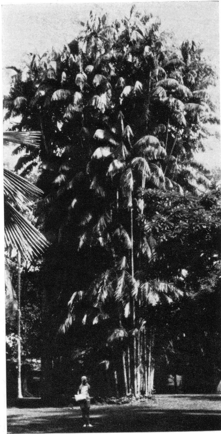
2. Phyllis is dwarfed by towering cluster of Oncosperma fasciculatum , Waterfall Gardens, Penang.