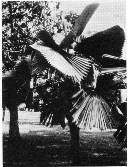
3. A magnificent Licuala sp. may be seen in Waterfall Gardens.

as the gardens themselves, or obtain any available catalog of plants, or official permission to collect seeds. Not many seeds were available anyway, unless they were more plentiful behind the locked nursery gates.