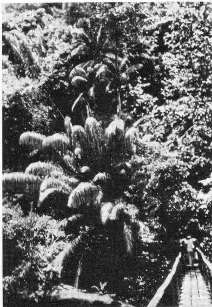
9. Eugeissona insignis along trail in Bako.