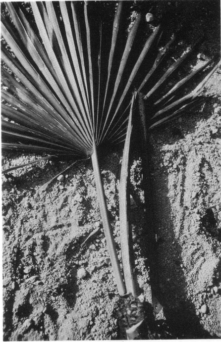
5. Leaf of a young Livistona carinensis .

sown recently on the 15th of April to test the germination power after one year. It is too early to reach conclusions about their viability. Of approximately 50 seeds planted at Fairchild Garden in March 1984, 41 germinated and the developing seedlings seem to present no cultural problems.