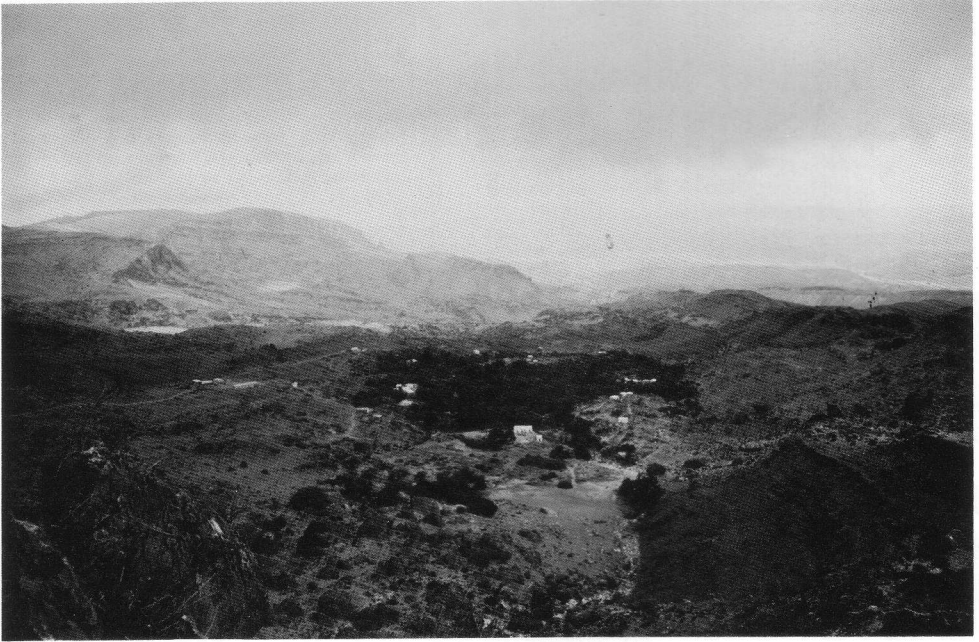
1. The mountain oasis at Galgala.

49°03' long./10°59' lat. and at an altitude of 875 m, 30 km west from Carin. There are about 3,000 date palms distributed among private gardens and the water comes from a spring. The tall Livistona rise above the date palm trees (Figs. 1,2), and as a consequence they are very easy to count: only 15 tall Livistona remain. Nevertheless, the regeneration seems to be excellent. In the 30 gardens visited, I counted 120 plants with a minimum height of 20 cm and a maximum of 1.5 m together with hundreds of one-leaved plantlets. Following the information given by the inhabitants of Carin and Galgala, I visited three other oases where Livistona still grows, oases that have never been mentioned in literature as far as I know. They are Marajo, Duud Shabeel, and Xamur (pronounced Hamour).