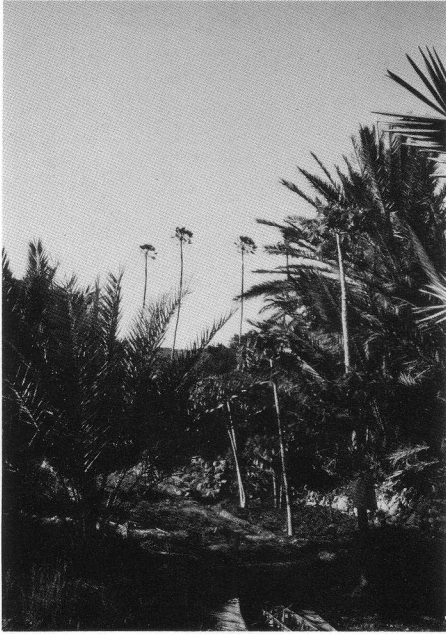
2. Livistona carinensis towers above date palms.