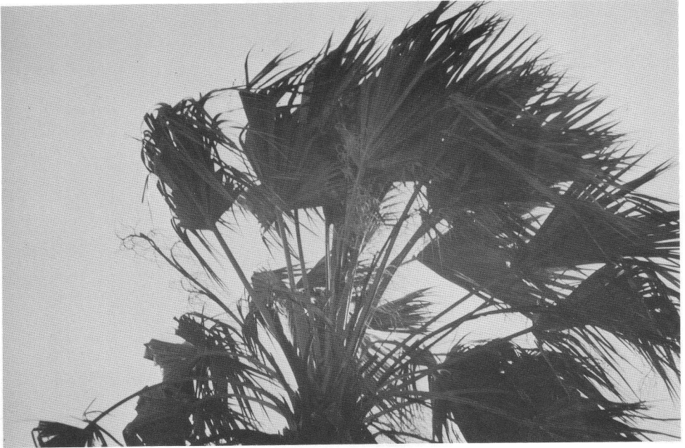
4. The crown of Livistona carinensis with windblown leaves and inflorescences.

opportunity to get an adult leaf or inflorescence except those fallen to the ground in Galgala. This one corresponds to the description made by Monod and has brown striated bracts. The young uprooted tree was 90 cm high with 13 equivalent roots, 30 cm long and three others a bit longer to 50 cm, with leaves 90 cm long, and petiole to 50 cm (Fig. 5). The description of the leaves corresponds to that in Chioventa (1929) with a ligule and spines with a swollen basis; the segments are glabrous with a prominent midrib and secondary veins joined by transverse ones. The segment margins are thick, as stated by Chioventa. The fruits are globose, 7 mm in diameter and brown. As for the flowering time (Fig. 4), old and new inflorescences are to be found on the palm at the same time. The cycle seems to be a little more complicated than that described by Monod. Regarding the fruits, there were many on the soil at the foot of the palms and I have collected some, both in Decem-