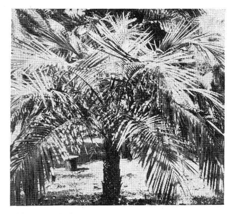
Fig. 43. A young tree of Arikuryroba schizophylla six and one-half years after planting out at the Sub-Tropical Experiment Station, Homestead, Florida.

below, colored dark purple-black especially on the margins. Somewhat weak but nevertheless sharp, upward-curving spines \frac{1}{4} - \frac{1}{2} inch long are produced along both margins of the upper part of the petiole, these becoming smaller and further apart or absent toward the blade. The rachis is round below with a prominent elongated pointed ridge above.