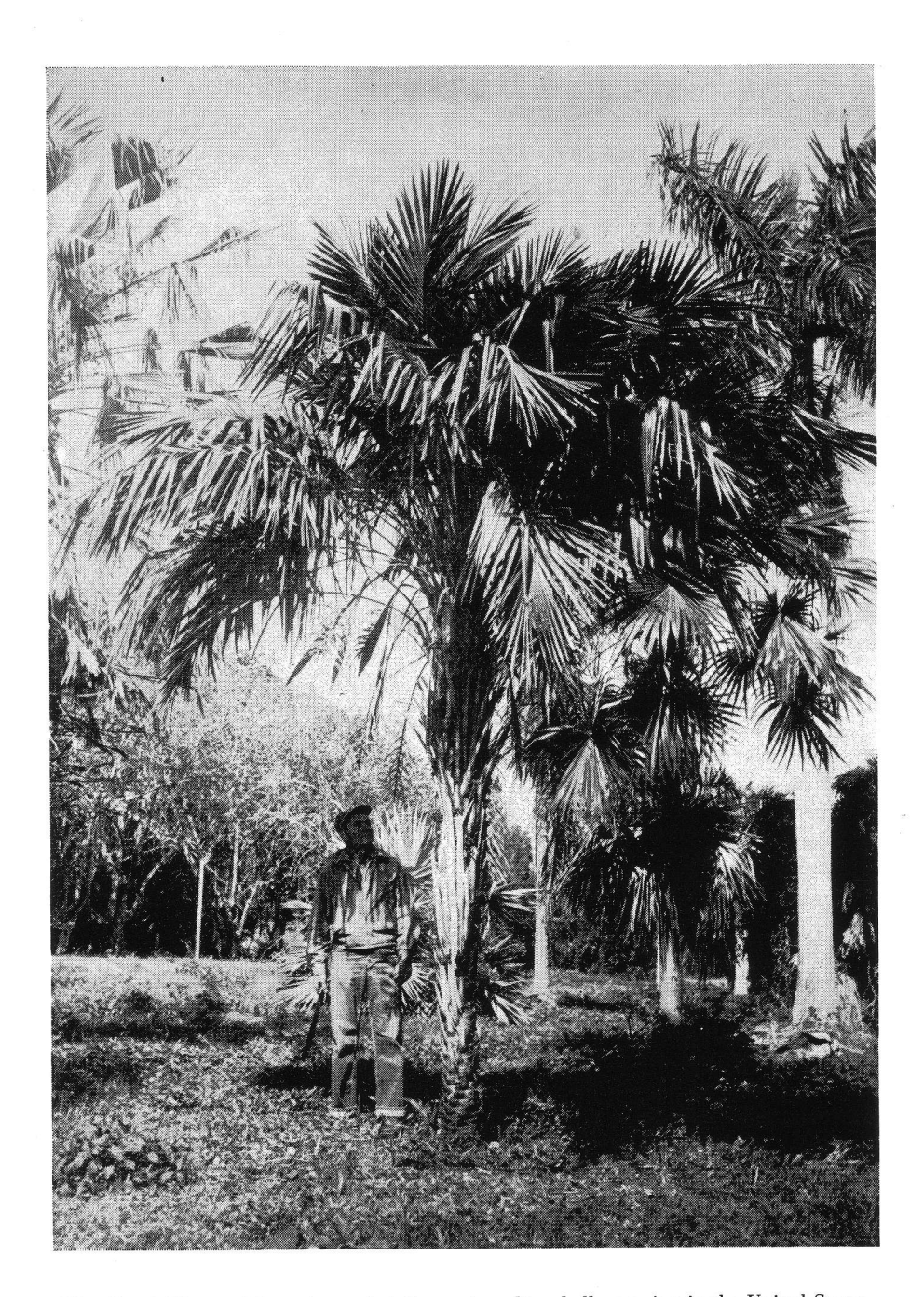
Fig. 42. A 20-year-old specimen of Arikuryroba schizophylla growing in the United States Plant Introduction Garden at Chapman Field, Coconut Grove, Florida.