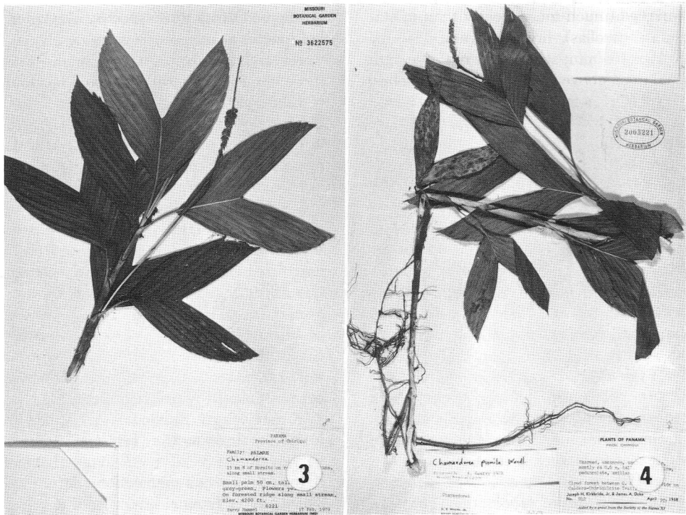
3. Chamaedorea verecunda (Hammel 6221); staminate specimen. Note basipetal maturation of flowers, those in the upper half of the spike having already fallen off. 4. Chamaedorea verecunda (Kirkbride & Duke 942); pistillate specimen.

surfaces. Inflorescences of both sexes spikeate, interfoliar. Staminate inflorescences (two seen) with peduncle included in sheath of subtending leaf, 13.3–18.9 cm long, bearing 2–3 bracts; rachis 6.5–9.7 cm long, the flowers maturing basipetally. Staminate flowers yellow, 3.6–5.1 mm long at anthesis, nodding; calyx ca. 0.5–1.0 × 1.7–2.0 mm, truncate or merely notched apically, hyaline, nerveless; corolla narrowly campanulate, narrowed at base where the lobes are fused in a tube ca. 1.1–1.6 mm high, the lobes valvate in bud, free at anthesis, virtually nerveless, ovate, 2.6–3.3 × 1.8–1.9 mm, rounded to obtuse or subacute apically; stamens 6, the anthers 1.2–1.5 mm long, narrowly ovate, somewhat narrowed apically, subsagittate at the base, the thecae loosely attached, dehisc-