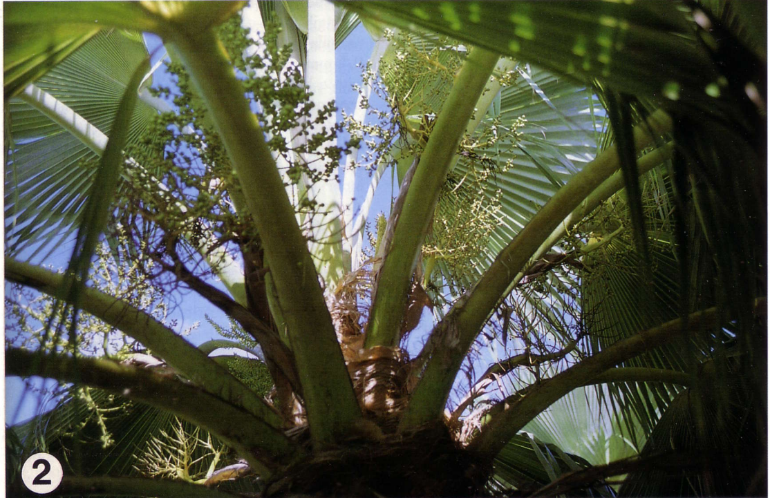
1. Pritchardia mitiaroana: the main population on Mitiaro, Cook Islands. 2. Pritchardia mitiaroana: view into the crown.