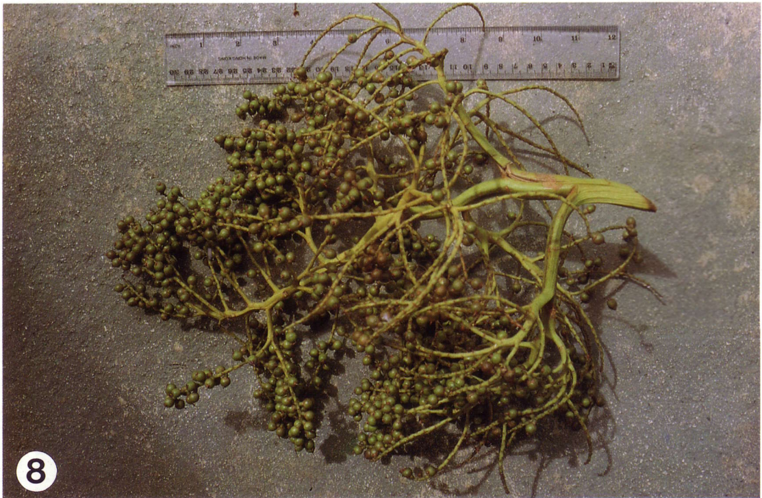
7. Pritchardia mitiaroana: detail of young infructescence. 8. Pritchardia mitiaroana: part of infructescence. (Photographs by Yves Ehrhart.)