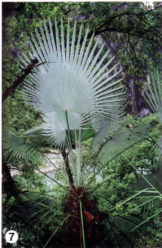
6. Trachycarpus princeps grows on vertical cliffs on tiny ledges and in small pockets of soil. 7. Trachycarpus princeps . The white backs to the leaves distinguish this Trachycarpus from all others.

was certainly no wholesale destruction as we had seen in, for example, Trachycarpus takil in India. Even if every accessible tree were to be cut down, this would still leave the vast majority of the population, some 400 or 500 mature plants in total. We feel that their future is quite secure.