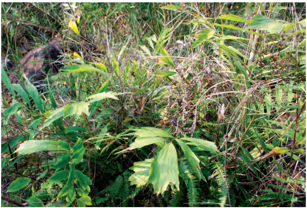
8. A clump of Arenga longicarpa in an open environment after deforestation of the gallery forest.

similar to those of some forms of Arenga caudata (Lour.) H.E. Moore, from which it is immediately distinguishable by its branched inflorescences (Fig. 7).