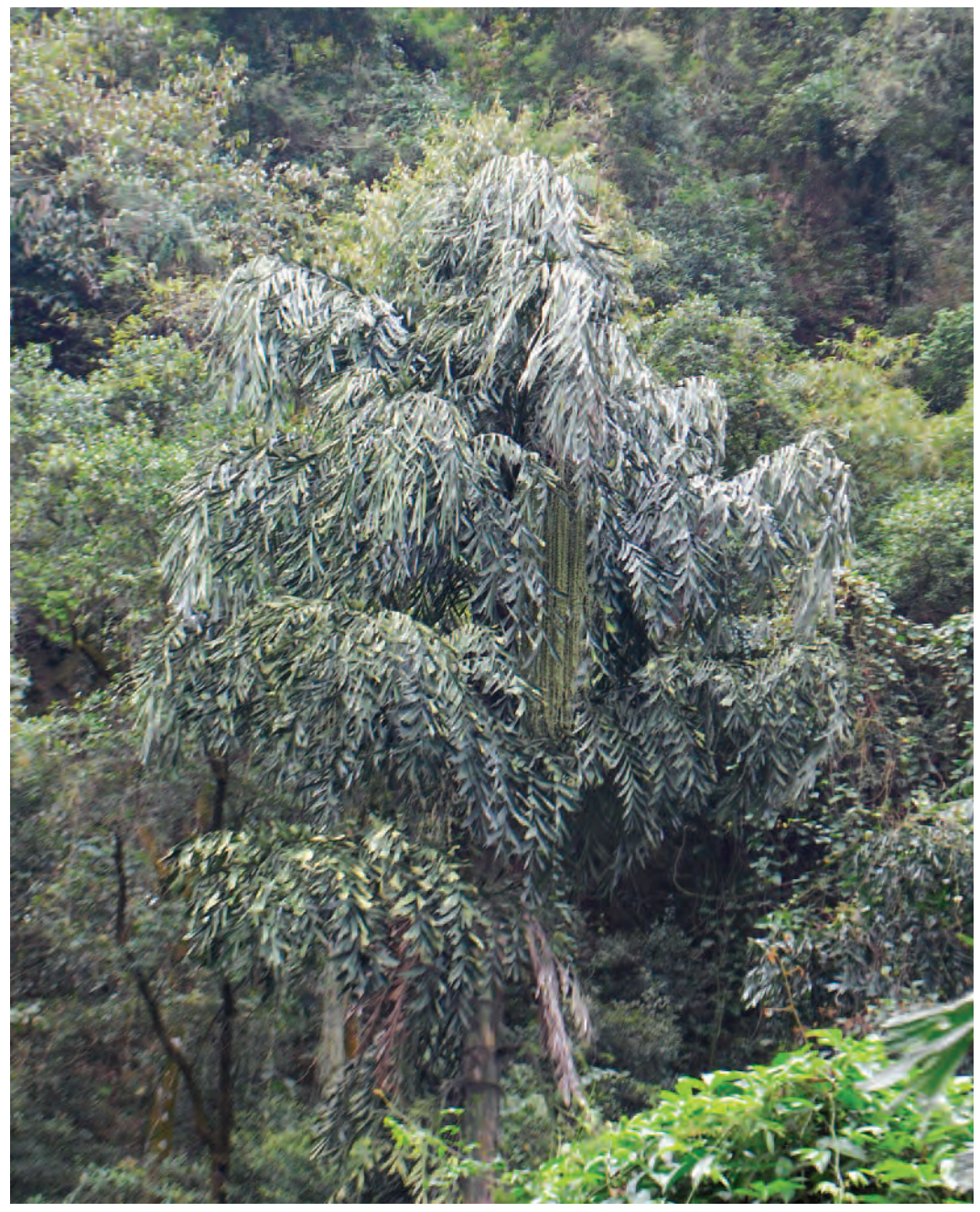
2. Caryota maxima, a common palm in Guangdong province.