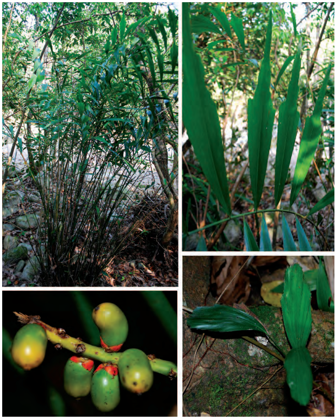
4. Arenga longicarpa. Top left: habit of a mature individual; top right: detail of the leaflets; bottom left: unripe fruits; bottom right: seedling.

desolate and highly modified landscapes of the southern part of Heweishan Natural Reserve. Again, our first instinct was to focus our time and attention on the banks of streams in the area (Fig. 3). A dam was built and created an artificial lake (Xiaoshui Brook). We decided to survey the downstream banks and quickly discovered, at about 295 m altitude, a small population of perhaps ten different clumps of