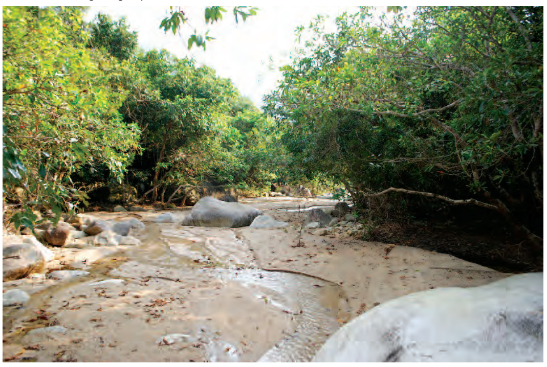
3. Habitat of Arenga longicarpa in Heweishan Natural Reserve.

After Baiyun Shan, we visited the locality where three collections were made in Dianbai county. The first day, after a six hour trip from Guangzhou, we followed our guide through the Heweishan Natural Reserve where he took us to Caryota mitis and Caryota maxima , two other representatives of tribe Caryoteae in this area. These two species were unfortunately the only species our guide could locate after having read the description. We were a bit desperate to find Arenga longicarpa after having seen the