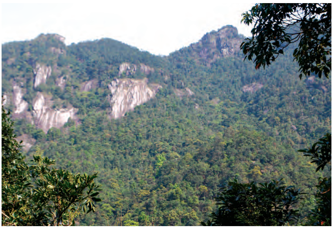
5. Pristine forest above 700 m elevation in Heweishan Natural Forest.

was formerly a conifer plantation. The trees had been devastated by a disease and then by a fire a short time before our visit, which gave the entire area a lunar landscape aspect. At about 700 m altitude, the forest reappeared and looked pristine (Fig. 5). The contrast was striking between the zone we just walked through and the beauty of the landscape we now faced. We walked for hours along different mountain streams but unfortunately did not find any other population of Arenga longicarpa . More field work is necessary to determine whether this species is present at this altitude range, where Calamus rhabdocladus (Fig. 6) is common.