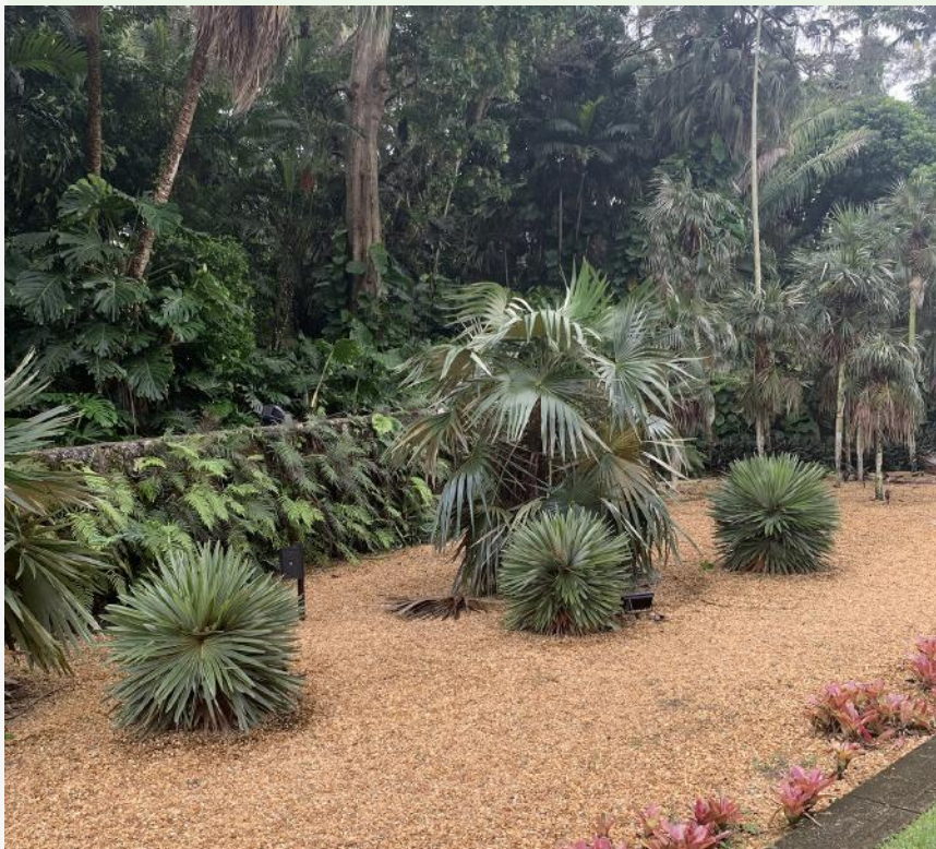
Hemithrinax ekmaniana from the limestone magotes of Cuba.

Only about 300 specimens occur in nature; the FTBG has seven, all grown from seed in the Fairchild nursery. These are over a decade old and known for their slow growth. Easily recognizable, "with their compact globose crowns, silver blue leaves and thin trunks at maturity- reminiscent of lollipops" (The Tropical Garden volume 73, number one, 2018).