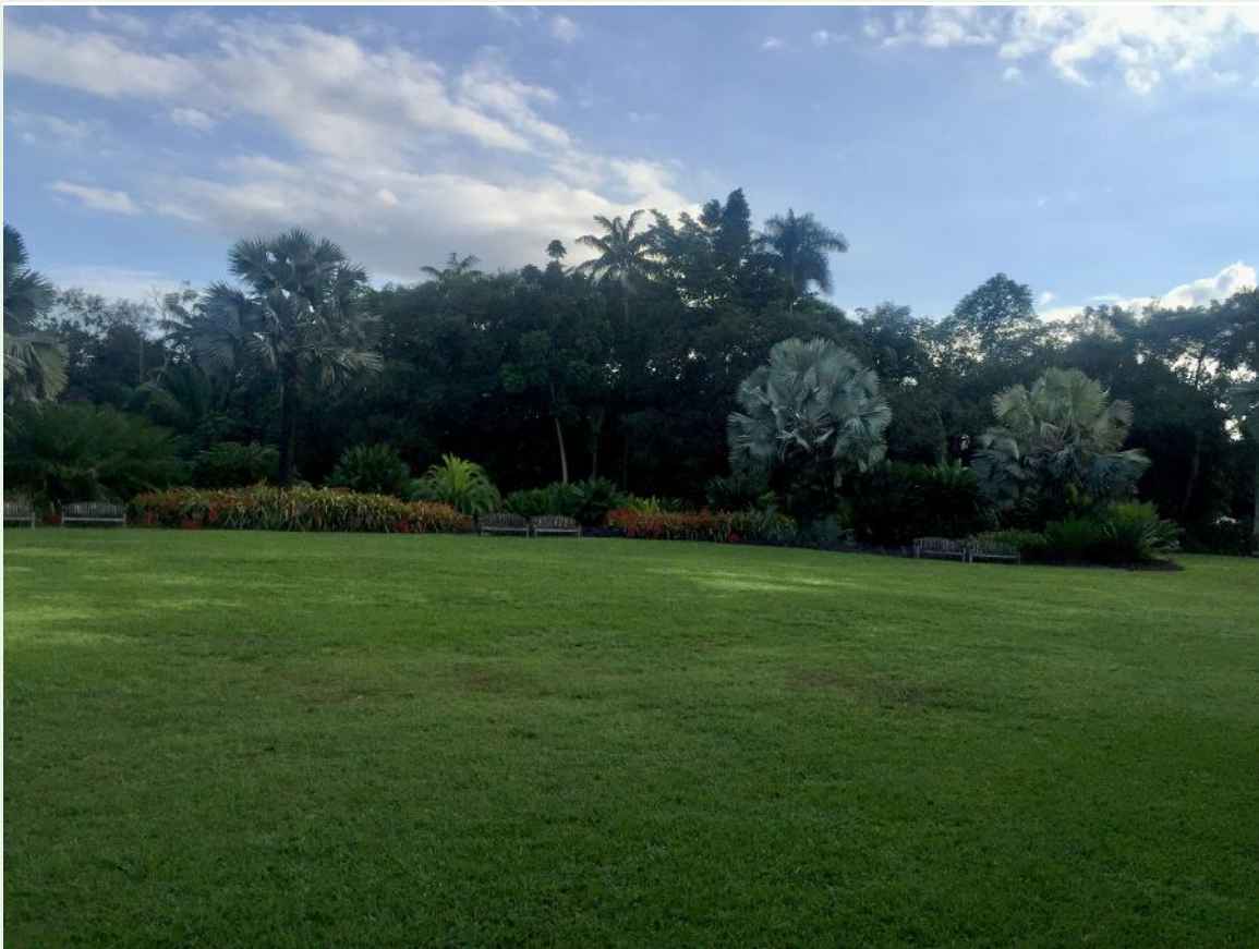
The grand lawn framed by Bismarckia nobilis .