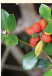
Evergreen Alyxia gynopogon

If you smell a strong foul or garlic-like smell while walking in the park during the spring months, it is likely from this medium sized tree. Sharkwood has yellow flowers and seeds that form in capsules and are red when mature. It is found throughout the national park.