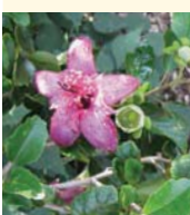
Phillip Island hibiscus Hibiscus insularis

The abundant pink flowers give the bastard oak its Latin name floribunda . Growing to around 15 metres tall, it is mostly limited to isolated stands within and immediately surrounding the park. Not only is this species endemic to Norfolk Island, the Ungeria genus is found nowhere else in the world.