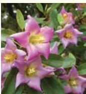
White oak Lagunaria patersonia

One of Norfolk's best known symbols and common across the island, this magnificent tree can grow as tall as 60 metres. Cultivated around the world as an ornamental tree, its wood is used for construction, wood turning and crafts. The seeds are a popular food for the endangered green parrot.