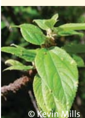
Nettle tree Boehmeria australis australis

This is a commonly occurring, large and spectacular tree on Norfolk Island. It can grow to more than 20 metres tall. Its pink and mauve coloured flowers fade to white with age and have a waxy texture. Watch out for the seed pods which contain sharp hairs that can irritate your skin.