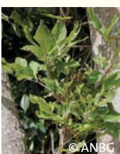
Sharkwood Dysoxylum bijugum

Reaching 10 metres in height, its attractive bright red fruit is one of the green parrot's favourite foods. This palm is known locally as niau. Early settlers used the growing tip as a vegetable. They also used the ribs of the palm fronds for making brooms and wove the fronds into baskets.