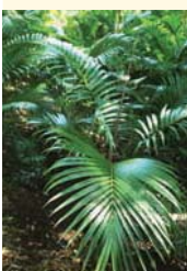
Norfolk Island palm Rhoplostylis baueri

Samson's sinew, also known as wild wisteria, often appears as large woody coils hanging from the tops of trees. Its springtime flowers are cream-coloured, sometimes with a bluish tint. They are followed by thick bean-like velvety pods. You will find this vine throughout the botanic garden and in the south-western section of the park.