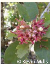
Bastard oak Ungeria floribunda

With sandpaper-textured leaves and a serrated leaf margin, this small, spreading tree occurs naturally within and adjacent to the national park and botanic garden. There were fewer than 50 mature trees remaining, but propagation and planting has seen the numbers and distribution increase on Norfolk. Unlike other nettle trees, this one will not sting you.