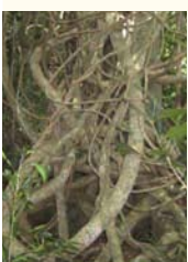
Samson's sinew Milletia australis

While the entire wild population of this plant is confined to Phillip Island, thanks to widespread plantings it is now well distributed throughout Norfolk Island. Its beautiful flowers are cream to light green with a dark magenta centre when they first open. The flowers then redden as they age.