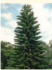
Norfolk Island pine Araucaria heterophylla