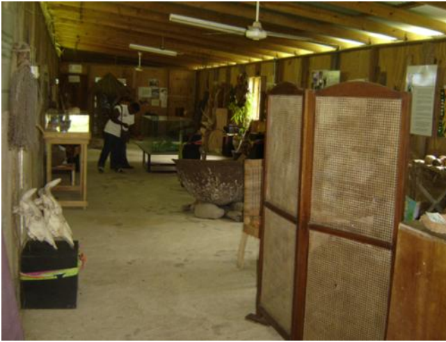
Charles Town Maroon Museum