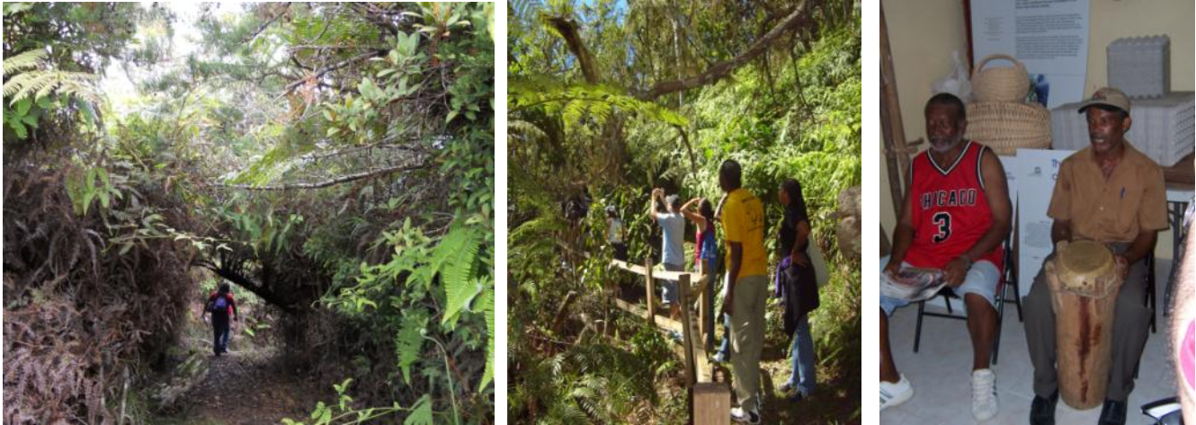
From left to right: Oatley Mountain Trail BJCMNP ; Oatley Trail at Holywell ; Moore Town Maroons

Both sites provide opportunities, particularly to residents of Jamaica, to enjoy nature, which is the first step in raising awareness about the value of biodiversity. Visitation records over the past nine years show a slow increase in the number of visitors at Holywell, following declines linked to major storms between 2004 and 2005 (Figure 2), suggesting an increasing appreciation for nature-based recreation. Visitation peaked in 2009 with a special programme for school groups that visit Holywell for educational and interpretive programmes where they participate in a variety of activities. The Kids Discovery Zone at Holywell is a play area designed for three to ten year olds, its focus is learning through fun activities such as games and stimulation of the senses. For example, at the Coney Mound inside the Kids Discovery Zone, children dig in the sand like the endemic Jamaican Hutia ( Geocapromys brownii ), commonly known as the Coney, burrowing underground, and an interpretive sign depicts and describes this animal and its conservation. In addition to raising the awareness of visitors, training local community youth as tour guides for these programmes provides locals with the opportunity to use biodiversity sustainably to generate an income.