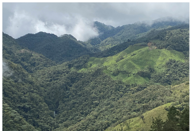
Selva de Florencia National Natural Park, Colombia.

We selected the San Antonio river basin to conduct the tree sampling since this area was mostly demined by 2016. We defined two zones in the basin (with an elevational range between 1,361 and 1,690 m) based on the presence of anti-personnel mines during the armed conflict (information provided by locals using an