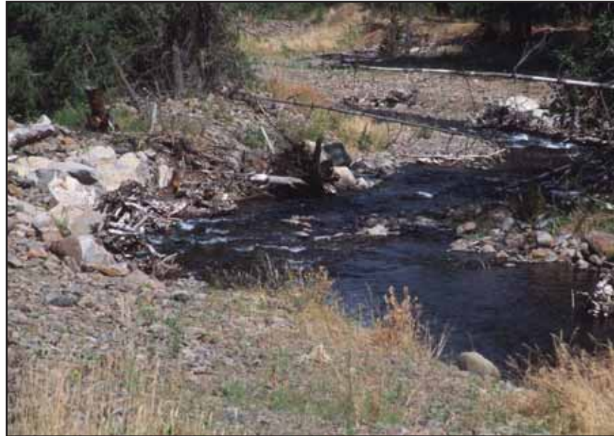
Large wood and rocks provide in-stream habitat for wildlife. Note the reduced vegetation along the stream bank as a result of over grazing.