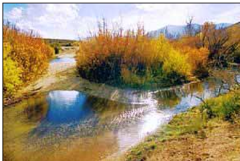
Nevada Department of Conservation and Natural Resources

Although all three mesic habitat types are important centers for biodiversity, this document focuses specifically on riparian areas. A riparian area can be defined as an aquatic ecosystem (stream or river) and the surrounding terrestrial areas (side channels, floodplains, or wetlands) where vegetation may be influenced by elevated water tables or flooding and by the ability of soils to hold water. Water in riparian areas may be permanent or ephemeral, and streams may flow intermittently or perennially. The edge of a riparian area can often be inferred based on the presence of obligate or facultative riparian plant species, which require readily available