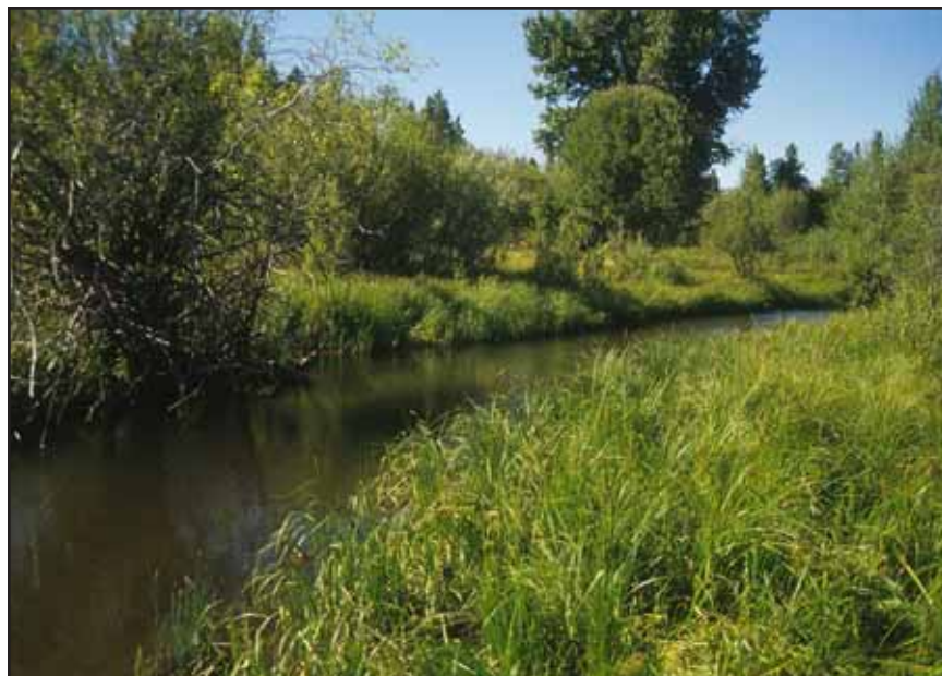
A vegetated riparian buffer offers countless economic and ecological benefits.

Natural groundwater systems fluctuate over time depending on the rate of recharge. Human land uses often decrease recharge because they decrease the amount of pervious surface. Riparian areas are important sites for groundwater recharge