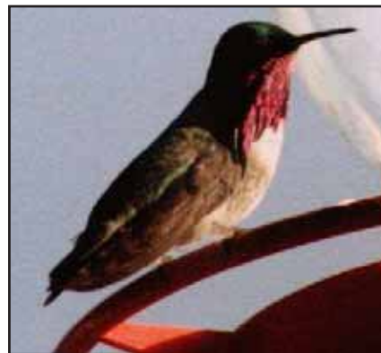
Male calliope hummingbird

The Green-tailed Towhee is gray underneath with greenish upperparts. Adults have a rufous crown and a white throat-patch. Juvenile birds are brown-and-white streaked; with a yellowish wash on their wings. Almost all of the activities of a green-tailed towhee are ground-centered, under the cover of shrubs and bushes. Green-