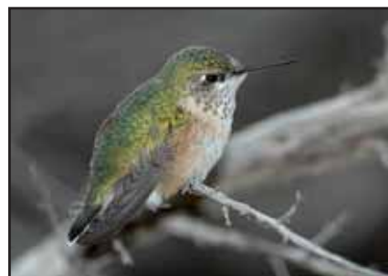
Female calliope hummingbird

Bill Schmoker http://schmoker.org/BirdPics