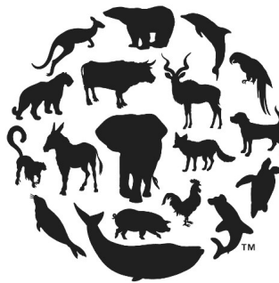
HUMANE SOCIETY INTERNATIONAL