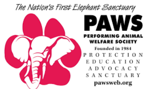
The Nation's First Elephant Sanctuary