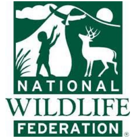
NATIONAL WILDLIFE FEDERATION®