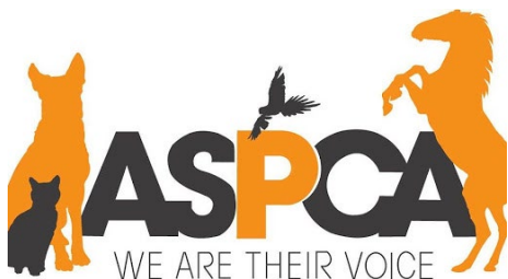
ASPCA WE ARE THEIR VOICE