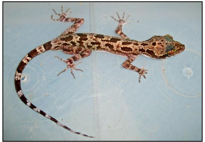
Cyrtodactylus jarujini Ulber, 1993 – Phu Thok, Bueng Kan Province (O S G Pauwels)

The type locality is within the Nam Nao National Park and is a popular tourist attraction, with the clearing near the resurgence cave having many visitors at holiday times. The Phu Luang National Park is a sandstone mountain that has a limited number of visitors and is a less disturbed habitat.