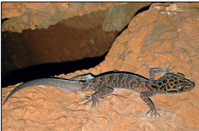
Cyrtodactylus erythroptus Bauer, Kunya, Sumontha, Niyomwan, Panitvong, Pauwels, Chanhome and Kunya, 2009 – Tham Pakarang, Mae Hong Son Province, in situ.

This gecko has alternating whitish to greyish-brown and chocolate brown transverse bands on the back. The chocolate bands have paler centres while the greyish-brown bands commonly have darker centres. There are six dark bands between the shoulder and hip and another on the base of the tail. The gecko has green eyes (Bauer et al. , 2010).