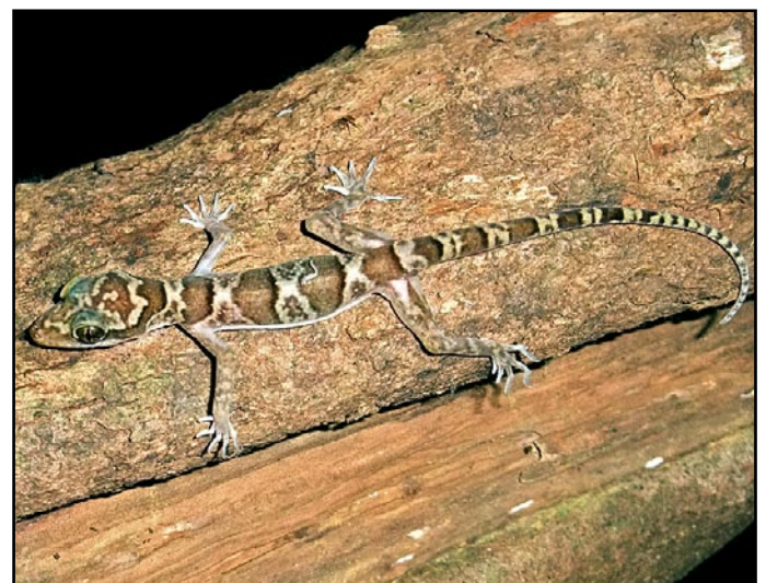
Cyrtodactylus sumonthai Bauer, Pauwels and Chanhome, 2002 – Khao Wong, Chanthaburi Province (Nonn Panitvong).

C. sumonthai has a base colour of a pale yellowish white. This is banded with pale brown markings, each of which is outlined by a darker brown border that is more prominent towards the front than the back. There is one dark band across the shoulders, two across the trunk and one across the hips. This pattern on the back fades on the gecko's flanks. The alternating pale and dark pattern of the back continues on to tail, becoming more diffuse towards the end. The eye is golden brown (Bauer et al. , 2002).