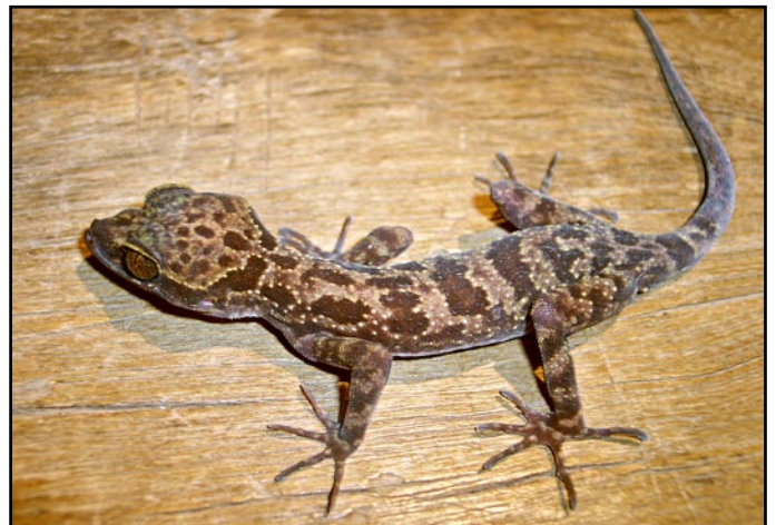
Cyrtodactylus jarujini Ulber, 1993 – Phu Sing, Bueng Kan Province (O S G Pauwels).

Jarujin Nabhitabhata, who caught the type series, recorded that, “ at night they were seen crawling on sandstone boulders on the hill top, especially on the steep sides of the rocks; being disturbed by the torch light, they hid under overhanging tangles of vegetation on the top of the rock sides ” (Ulber, 1993). More recently Sumontha et al. (2008) found it in two caves on two sandstone hills, Phu Sing and Phu Thok, where it was staying by day on the walls and crevices, going out of the caves at night. Both in Phu Sing and Phu Thok it was found in syntopy with the cave-dwelling agamid Mantheyus phuwuanensis . C. jarujini has also been recorded from central and northern Laos (Stuart, 1999) but the exact identity of the Lao populations has to be re-evaluated.