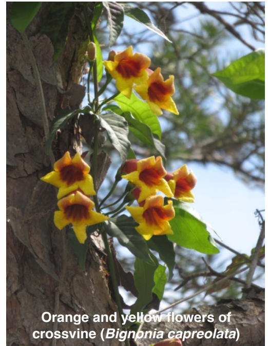
Orange and yellow flowers of crossvine ( Bignonia capreolata )

( Vaccinium arboreum ), the common bristly locust ( Robinia hispida ), with its pretty pink flowers and intensely thorny stem, the red chokeberry ( Photinia pyrifolia ), and finally, what we came to Alabama to see, the green pitcher plant ( Sarracenia oreophila ), beautifully in flower, along with a Dwarf iris ( Iris cristata ) tucked into the grass. Dozens of ancient Virginia pine ( Pinus virginiana ) that had clung to the cliffs for a century were dead or dying due to drought, flowering fringe trees ( Chionanthus virginicus ) waved gaily beneath them. Our visit culminated at the overlook to the spectacular Little River Falls.