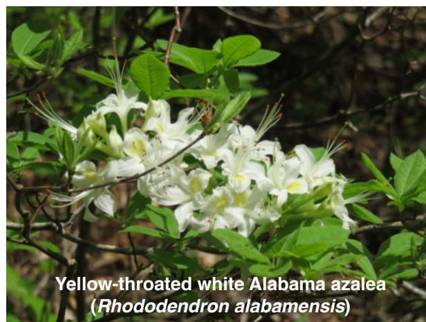
Yellow-throated white Alabama azalea ( Rhododendron alabamensis )