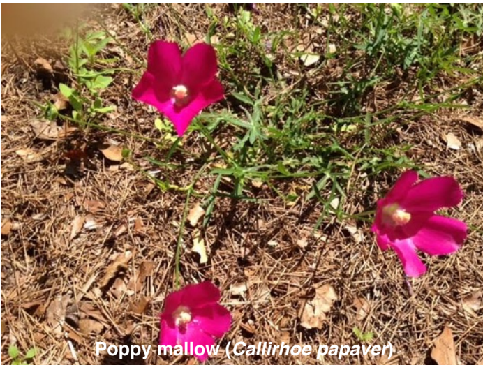
Poppy mallow ( Callirhoe papaver )