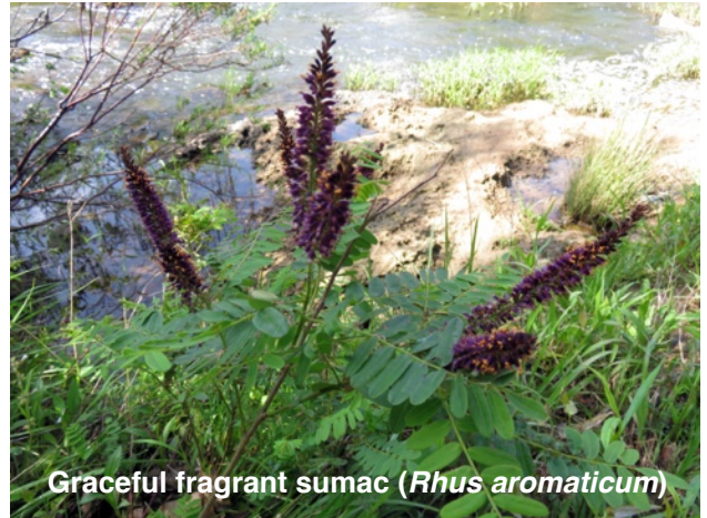
Graceful fragrant sumac ( Rhus aromaticum )

At Cane Creek Canyon Preserve, our host Jim Lacefield is author of Lost Worlds and Alabama Rocks . In an old field was fragrant Eastern bee-balm ( Monarda bradburiana ). The steep trail down the canyon drops through rock clefts, and down stone steps. A fossil-specked ledge with a spectacular cascade of water had been a beach during a prehistoric era. Tucked into crevasses is French's shooting star ( Dodecatheon frenchii ). We had a magnificent vista of the valley. The Butternut Hickory canker is wiping out "white walnut". River banks at the canyon bottom had scattered river cane ( Arundinaria