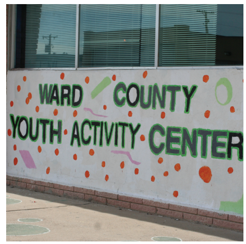
(Above, left to right) Buckner Children & Family Services, Midland Habitat for Humanity, and Monahans Kidz Zone were among grantees receiving funds in 2010.