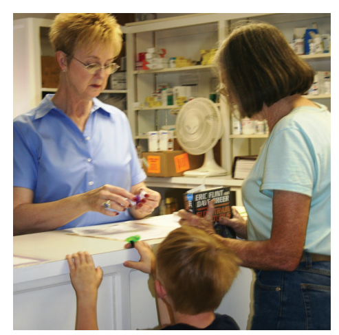
(Above, left to right) MARC, Big Brothers Big Sisters of Midland, and Community Children's Clinic received competitive grant awards in 2010.