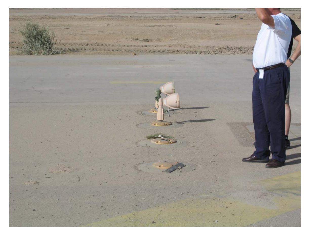
Damaged approach light fixtures

The main deficiencies in the condition of the airfield ground lighting system were as follows: