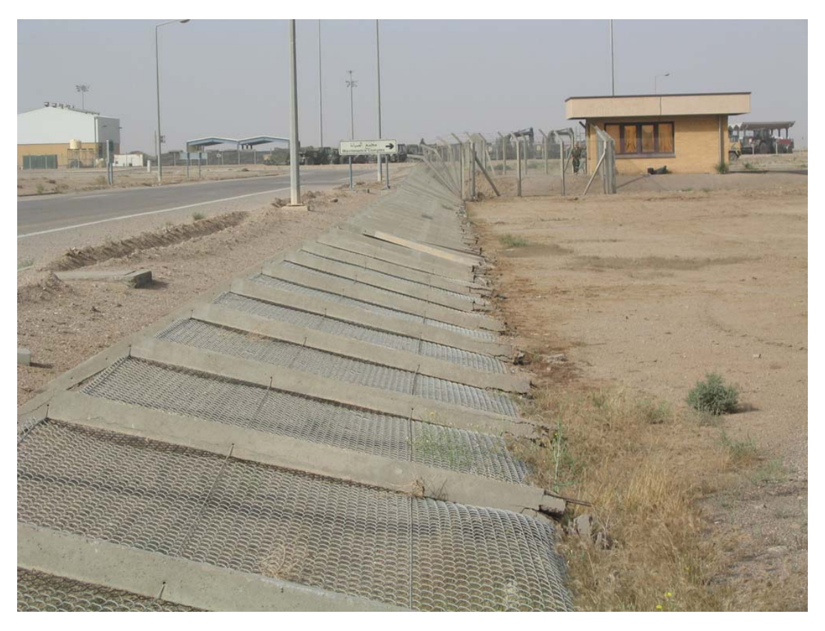
Security fence posts damaged by salt attack