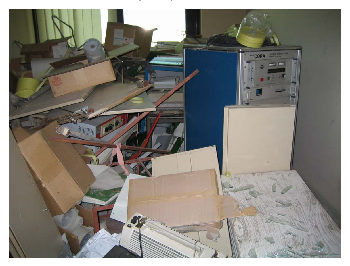
Evidence of looting at the Met Office

The meteorological building complex located west of the radar site is in relatively good structural condition. The rooms have been looted and equipment has been damaged or removed, but there is no major damage to the MET building envelope, observation room or the upper level balloon launching building.