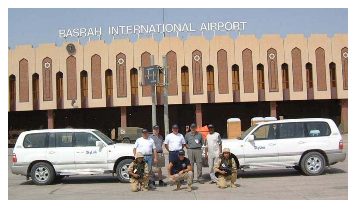
The Assessment Team at Basrah International Airport, April 27, 2003

It should also be stated that this report contains the findings of the assessment as of the date that it was made. Since that time, the British Forces have been continually making improvements to the airport infrastructure and enhancing its operational readiness. The first commercial aircraft movement was made by a Virgin Atlantic B747-400 aircraft on May 1, carrying 60 tons of humanitarian aid.