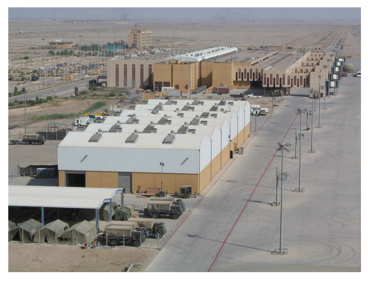
Air cargo and the passenger terminal viewed from the control tower

Baggage handling devices and conveyors for both inbound and outbound baggage were assessed by the British forces to be in working order. Outbound baggage is manually sorted, and installation of a bar-code sortation system may be required when traffic levels increase.