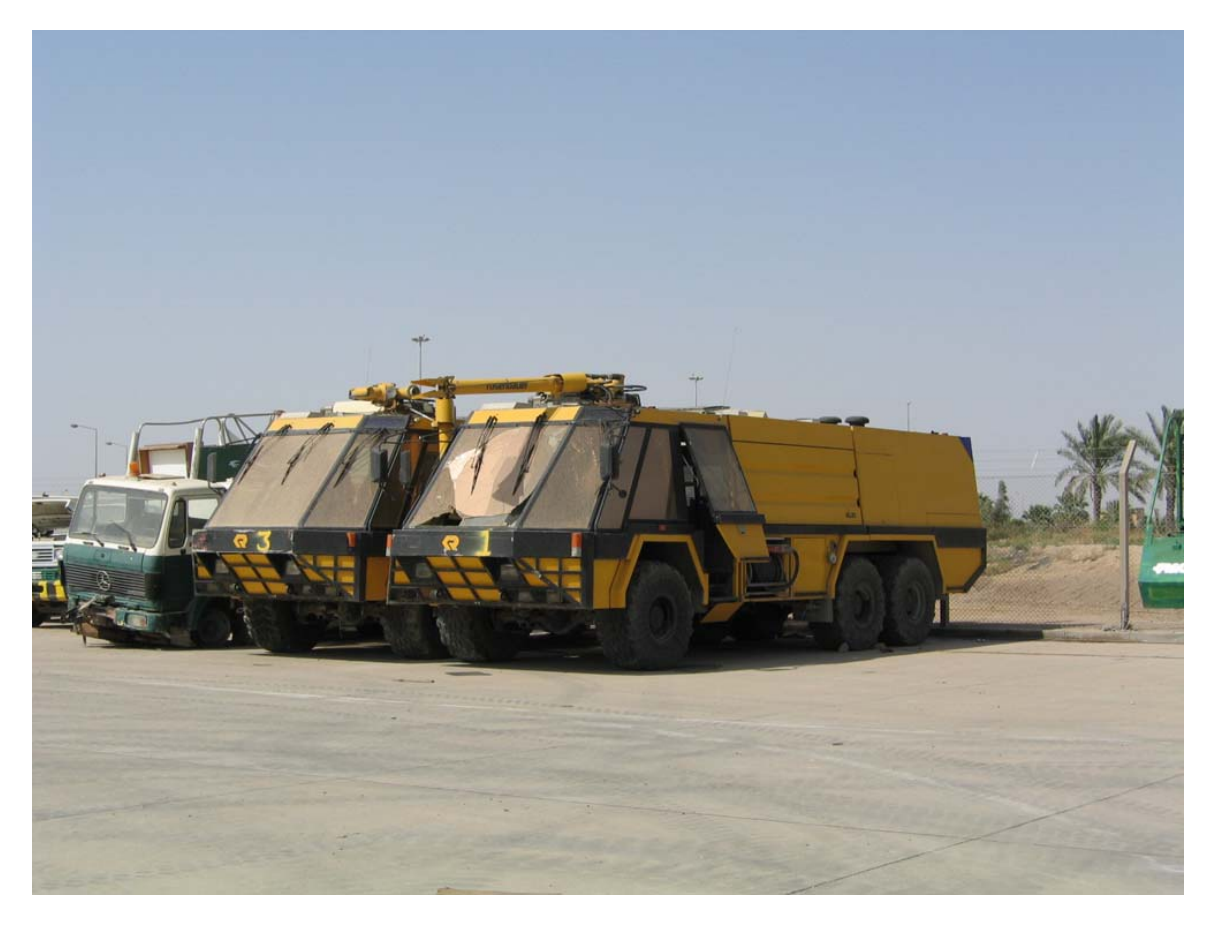
Unserviceable fire trucks and ground handling equipment

The 5-bay airside firehall located central to all aircraft manoeuvring areas is in excellent structural condition, and all major electrical and mechanical components can be restored to service fairly quickly in terms of the building envelope. The current facilities are being used as dormitories for the British forces, but there is still a significant amount of firefighting apparel located within the building including masks, high-temperature suits, hydrant connections etc. The equipment was scattered in the building and requires a detailed assessment of individual sizes and serviceability. There was no aqueous foam located within the building and this will need to be restocked.