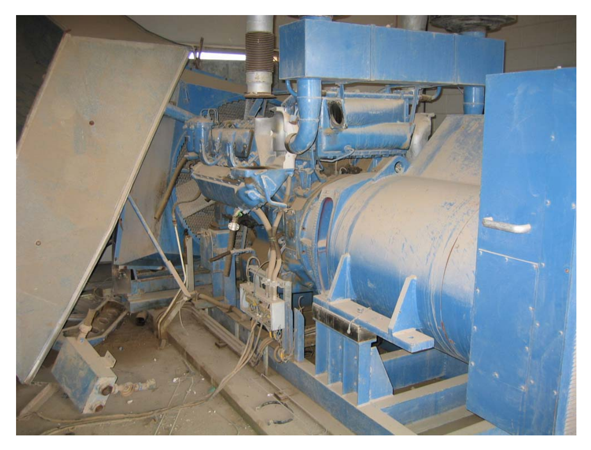
Damaged generator set at Field Electrical Centre

• The Field Electrical Centres (FECs) at end runway end have been damaged with the lighting control cabinets, switchgear, standby generators and regulators (CCRs) all vandalized. We understand that the CCRs that originally were supplied for the AEG lighting system were removed and sent to Baghdad a few years ago. The existing units are over 30 years old and their coils have been removed for copper content. The FEC buildings are in good condition with only