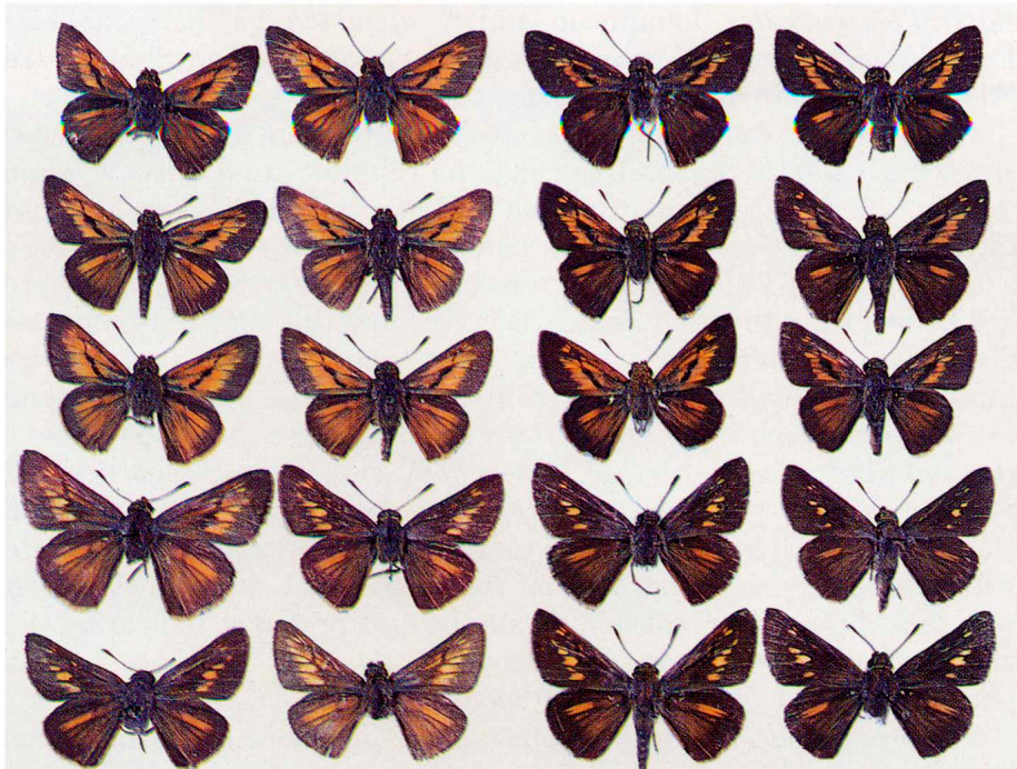
Figure 2. Comparison of ventral wing pattern in the Bay Skipper (Columns 1 & 2) and the Dion Skipper (Columns 3 & 4).