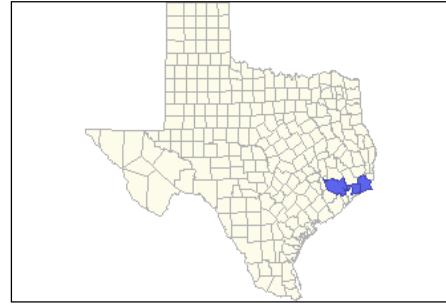
Figure 5: Texas Range of the Bay Skipper. Highlighted county denotes its range.