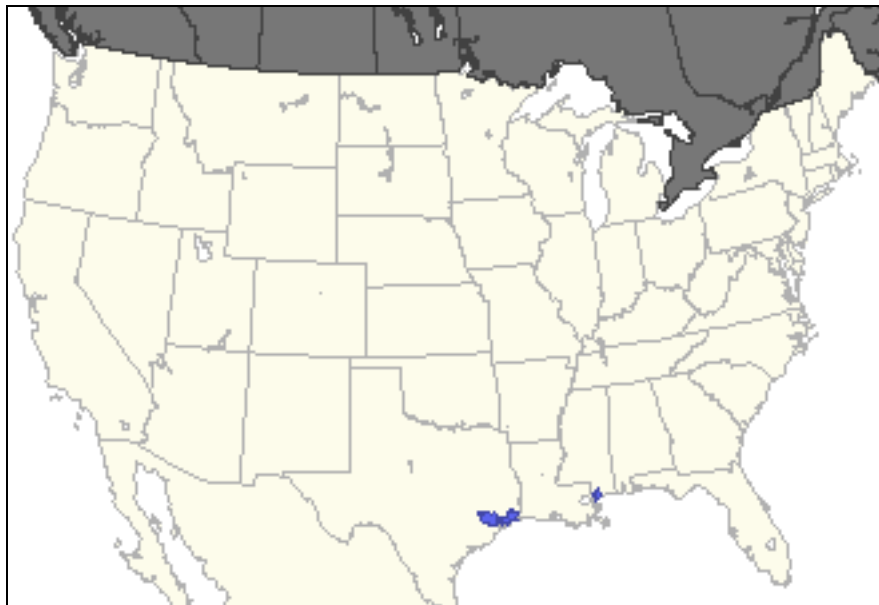
Figure 3: Global Range of the Bay Skipper.

The Bay Skipper is known from Chambers and Jefferson counties in Texas and Hancock County in Mississippi. It may also occur in Louisiana and Alabama, as its tidal sawgrass habitat is abundant on the coast of those two states, and perhaps neighboring states. See Figures 3-5.