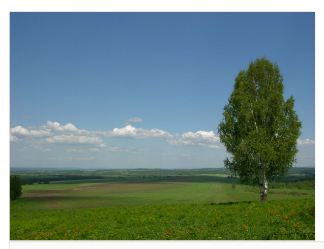
Figure 3. doi Kuznetsk Depression: forest steppe landscape now is anthropogenically strongly transformed.

Sampling description: At the sampling stage, the task was to fully cover all types of potential moss habitats – both widespread and rare. On a series of key sites, work was carried out in a stationary or semi-stationary mode; other territories were surveyed by the route method.