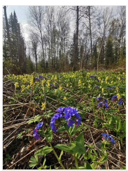
Figure 2. doi Early spring in chernevaia taiga on Salair Ridge: alternation of groups of Populus tremula and Abies sibirica with herbaceous communities.

3. The 'intermountain basins' dataset (Pisarenko 2021c) provides information on moss distribution and ecology in the Kuznetsk Depression (Fig. 3). It consists of 1690 occurrence records. The altitudes of the territory mainly are 110-330 m a.s.l., only a few localities on the sides of the basin and on the low Karakan Ridge exceed these values. The main habitat types are grassy birch and aspen forests from dry to boggy, Salix thickets in floodplains, mires and rock outcrops in river valleys.