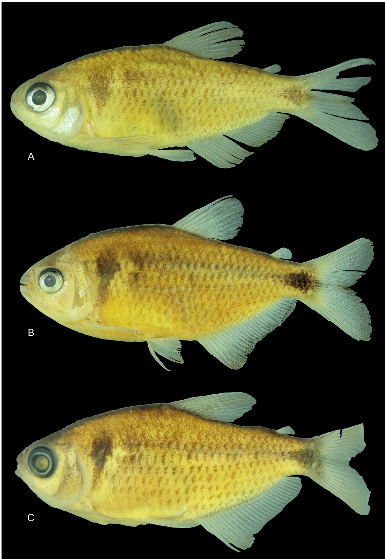
Figure 1. Astyanax biotae . A. MZUSP 79807, paratype, 42.5 mm SL, Paraná state, municipality of Diamante do Norte, córrego Água Mole, affluent of Paranapanema River, 22°38'31" S, 052°48'59" W. B. MZUEL 4529, topotype, 55.0 mm SL. C. NUP 15137, 44.1 mm SL, Mato Grosso do Sul state, municipality of Jateí, Peroba creek, affluent of Ivinhema River, 22°54'54" S, 053°39'07" W.