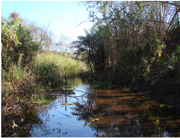
Figure 3. Brazil, Mato Grosso do Sul state, municipality of Jateí, Peroba creek at Parque Estadual das Várzeas do Rio Ivinhema (PEVRI), affluent of Ivinhema River, 22°54'54" S, 053°39'07" W, locality of collection of Astyanax biotae .

The feeding habits for the specimens from rio Ivinhema were also determined. Astyanax biotae can be considered zooplanktivorous, as more than 80% of its diet was composed by microcrustaceans, mainly Copepoda. The other items consumed were chironomid larvae, ephemeropteran naiads, and fruits.