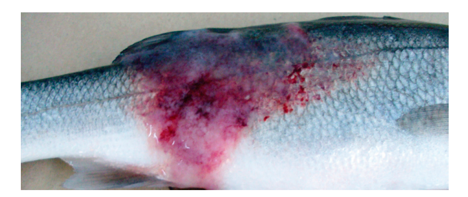
Figure 1. Ulcerative dermal lesions attributed to Mycobacterium spp. in striped bass (From Avsever et al. 2016, released under Creative commons [51]).

Following infection, mycobacterial organisms spread through the whole fish body via the circulatory and lymphatic system [2], and can be found in most tissues and organs, including the eyes, gills, visceral organs, and musculature. Internal signs associated with Mycobacterium spp. include organomegaly of the liver, kidney, and spleen. Gray and white nodules in internal organs can be observed occasionally (Figure 2) [2]. Acute disease is characterized by a rapid progress of the infection, uncontrolled growth of the pathogen and death of infected fish within 16 days, whereas chronic infections were defined by the presence of granuloma in different internal organs, and fish can survive approximately 4–8 weeks [1,52,53].