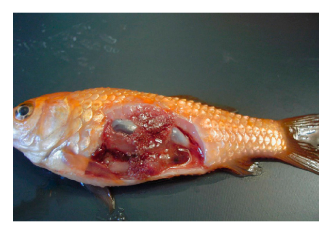
Figure 2. Gray and whitish nodules observed on internal organs of a goldfish ( Carassius auratus ) (From Passantino et al. 2008, reproduced with permission [54]).

Following infection, mycobacterial organisms spread through the whole fish body via the circulatory and lymphatic system [2], and can be found in most tissues and organs, including the eyes, gills, visceral organs, and musculature. Internal signs associated with Mycobacterium spp. include organomegaly of the liver, kidney, and spleen. Gray and white nodules in internal organs can be observed occasionally (Figure 2) [2]. Acute disease is characterized by a rapid progress of the infection, uncontrolled growth of the pathogen and death of infected fish within 16 days, whereas chronic infections were defined by the presence of granuloma in different internal organs, and fish can survive approximately 4–8 weeks [1,52,53].