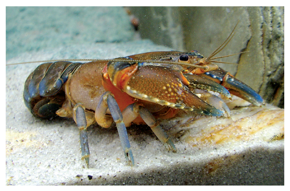
Figure 1. Euastacus morgani sp. n. Female specimen, ACP 1103.

TYPES. AM P.84264–P.84266, type locality, 25 March 2008, J. Coughran and R. B. McCormack, 29.94–39.87 mm OCL, 2 females, 1 male.