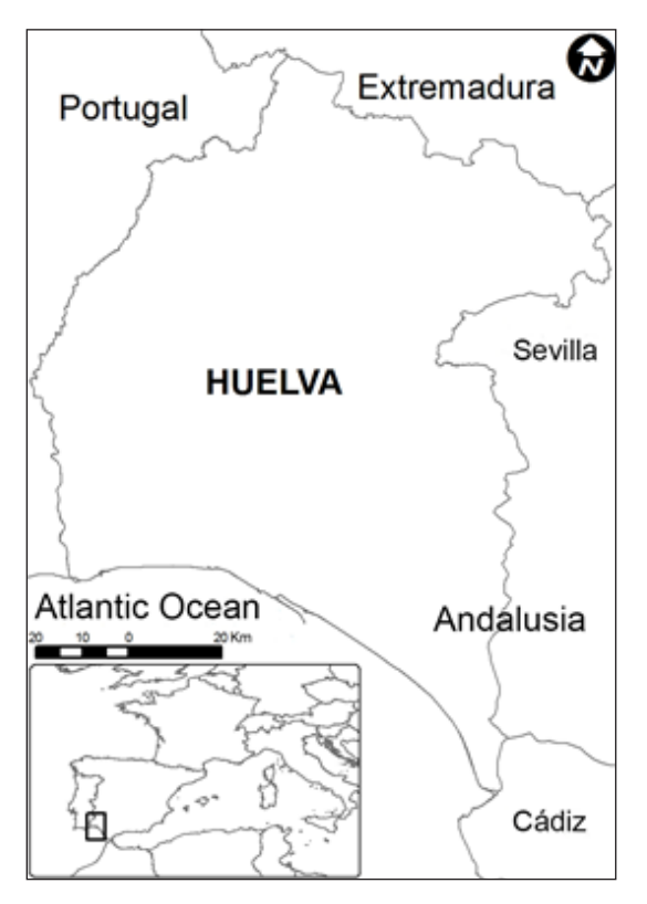
Figure. 1. Map of the study area, Huelva province (Andalusia, Spain).

Huelva has two large geostructural units. The northernmost almost two thirds form part of the Hesperian Massif (of Hercynian orogen), with a predominance of Precambrian and Palæozoic materials - shales, quartzite, and volcano-sedimentary and plutonic rocks. These mainly acidic rocks generally produce poor soils with underdeveloped profiles. The rest of the territory forms part of the Baetic (Guadalquivir) Depression. It acts as a receiving basin for eroded sediment from the Hesperian Massif and, above all, from the Baetic Ranges. The materials filling the basin during the most recent (Quaternary) period are lacustrine, fluvial (terraces and alluvial deposits), colluvial, eolian (coastal dunes, mantles), and from marshes formed by the closure of different river estuaries (Moreira, 2003).