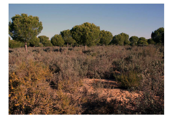
Photo 2. Xerophytic matorral or "monte blanco" characteristic of the Dunes and Sands landscapes, under canopy of Pinus pinea . In the foreground, on the left, with yellow flowers, Stauracanthus genistoides ; behind it shrub layer with predominance of Halimium halimifolium .