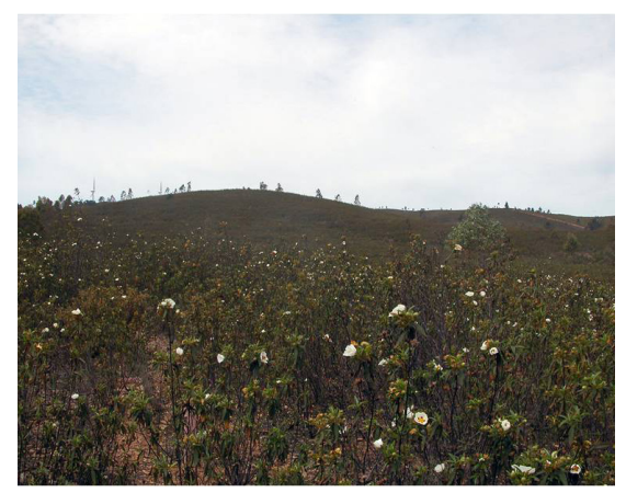
Photo 3. Rockroses with gorses of Genisto-Cistetum cistetosum ladaniferi , associated to Peneplains and Slopes landscapes. In the foreground, white flowers, Cistus ladanifer .