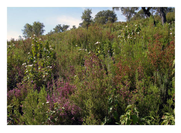
Photo4. Rockrose-heathsof Ericoaustralis–Cistetum populifolii , association included in C5, cluster linked to Sierras landscapes. Pink flowers: Erica australis; white flowers: Cistus populifolius .