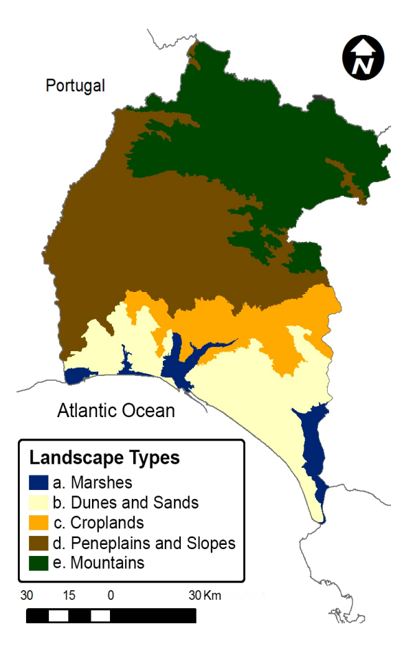
Figure 2. Map of Huelva province with the distribution of landscape types studied.

use and vegetation coverage, lithology and relief. By means of a TWINSPAN divisive multivariate hierarchical analysis, eight types of landscapes were distinguished. On the basis of this initial, a merged set of five landscape types was used for the present study (Figure 2).