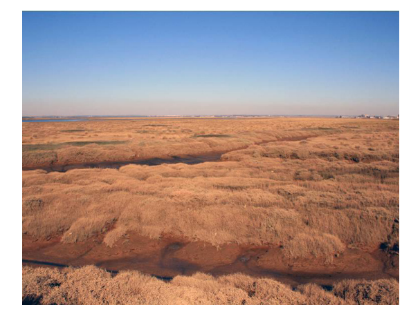
Photo 1. Halophilouscoastal communities ( Halimiono portulacoidis-Sarcocornietum alpinii ) proper to the Marshes landscapes, in December.