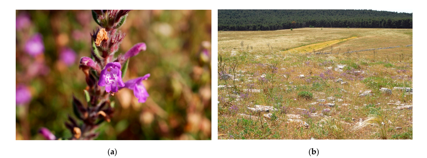
Figure 2. Clinopodium suaveolens (Sm.) Kuntze: ( a ) in flowering; ( b ) in its habitat, Acinos suaveolentis-Stipetum austroitalicae association.

Recently, some Satureja L., Micromeria Bentham, section Pseudomelissa Bentham species and all species of Calamintha Miller and Acinos Miller were transferred to Clinopodium by several authors [31–36]. Thus, the number of species belonging to the genus Clinopodium has reached about 100. They are mostly distributed in the New World (both temperate and tropical) and temperate Eurasia, but there are a few in Africa, tropical Asia, and Indo-Malaysia [37].