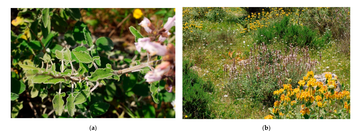
Figure 3. Salvia fruticosa Mill. subsp. thomasii (Lacaita) Brullo, Guglielmo, Pavone & Terrasi: ( a ) trilobe leaves; ( b ) in its habitat, Ruto chalepensis-Salvietum trilobae , Biondi & Guerra 2008.

Salvia fruticosa subsp. thomasii (synonym: Salvia thomasii Lacaita, S. triloba L.) is one of 1000 species belonging to the Salvia L. genus [52]. This perennial shrub is an endemic species located in some regions of the center–south of Italy [23]. In Apulia, the species has been detected in the central-eastern area of the "Gravine Arco Jonico" (Taranto), near Masseria Gaudella (Laterza) and in Gravina del Petruscio (Mottola). Other authors [18,53] observed that Gravina del Petruscio was the richest in individuals and presented a good capacity for renewal, while the population of a few individuals in Masseria Gaudella did not show a similar capacity. In all cases, there are doubts about the ability of this taxon to complete fruit ripening. The only available data are those related to the nominal species, whereas no scientific data related to the specific subspecies exist (Figure 3).