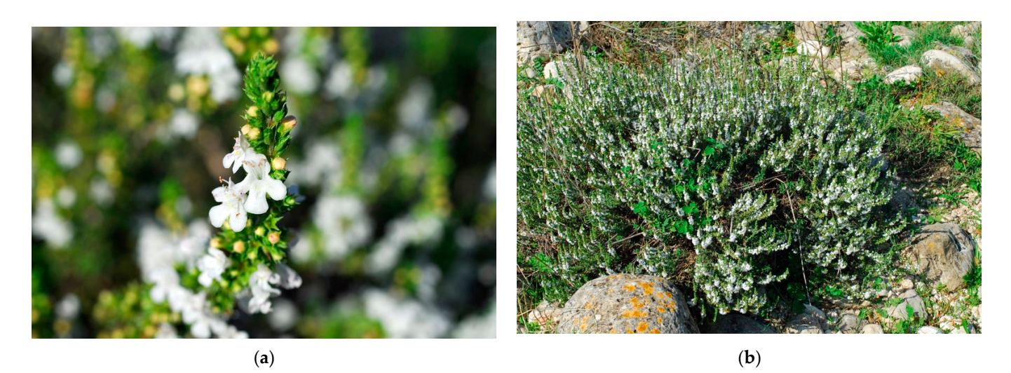
Figure 4. Satureja montana L. subsp. montana : (a) in flowering; (b) in its habitat, Asyneumo limonifolii-Saturejetum montanae , Biondi & Guerra 2008.

However, the literature has revealed large variations in the abundance of major components such as \gamma -terpinene (1 to 31%), p-cymene (3 to 27%), linalool (1 to 62%), and carvacrol (5 to 69%) [64]. These differences are due to the existence of different chemotypes, though differences are also much influenced by the sites, environmental conditions, and the plant vegetative state [62].