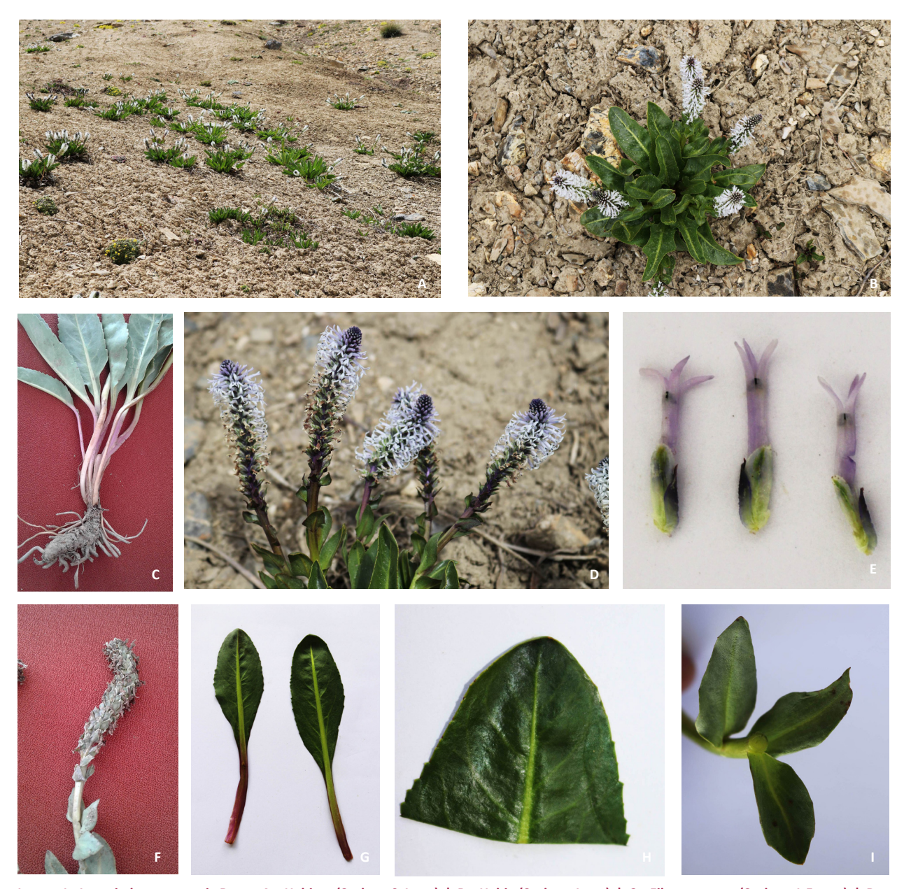
Image 1. Lagotis kunawurensis Rupr.: A—Habitat (Scale = 0.1mm) | B—Habit (Scale = 1mm) | C—Fibrous roots (Scale = 1.5 mm) | D— Inflorescence –spike (Scale = 6 mm) | E—Zygomorphic pale blue flowers (Scale = 8 cm) | F—Numerous overlapping bracts (Scale = 9 mm) | G—Obovate-lanceolate basal leaves (Scale = 6 mm) | H—Leaf with denticulate margins and acute-rounded leaf apices (Scale = 2 cm) | I— Sessile stem leaves (Scale = 8 mm).

entire Ladakh region. The number of mature individuals at the collection site was about 250 individuals, thus represented by a small population size.