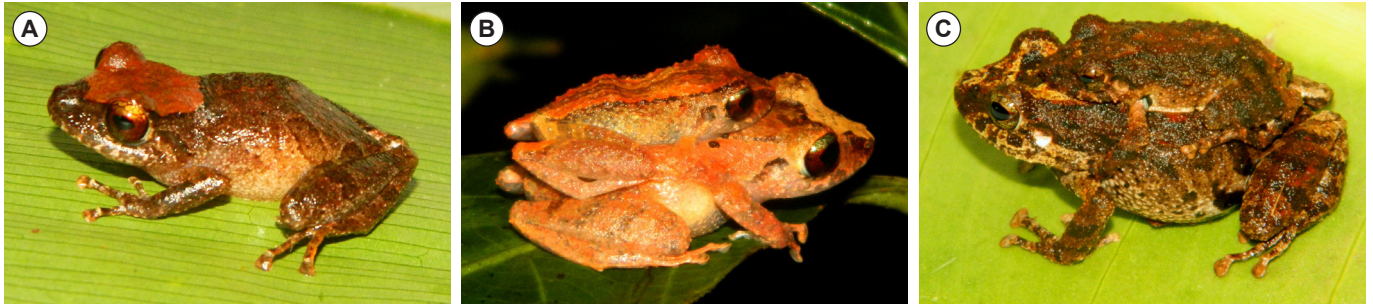
FIGURE 2. (A) Pristimantis achuar (UFAC 6052); (B) Pristimantis delius in amplexus (male: UFAC 6038, female: UFAC 6039); (C) Pristimantis orcus in amplexus (male: UFAC 6050, female: UFAC 6051) (photos from live individuals) in white sand forest, Mâncio Lima, Acre Brazil.

(2012), in contrast to Pristimantis orcus has slightly longer pulsations (812 ms vs. 424 ms in P. orcus ), with almost half of notes per second (1.225 vs 2.899 in P. orcus ) and has a slightly high dominant frequency (2110.77 Hz vs. 2048 Hz in P. orcus ). We identified the record as advertisement call based on the observed behavior. The amplexing pair was found perched on a leaf of Lepidocaryum tenue at 1.96 m above ground level. When placed into the plastic bag, they were separated and the male immediately began to vocalize with the goal of attract the female.