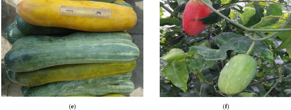
Figure 2. Edible Fruits in the wild/forest areas and villages: used as supplement to food ( a ) Madhuca latifolia J.F. Gmelin; ( b ) Buchnania lanzan Spreng; ( c ) Phoenix sylvestris Roxb; ( d ) Manilkara hexandra (Roxb.) Dubard; ( e , Cucumis sativus ; f , Coccinia grandis ).