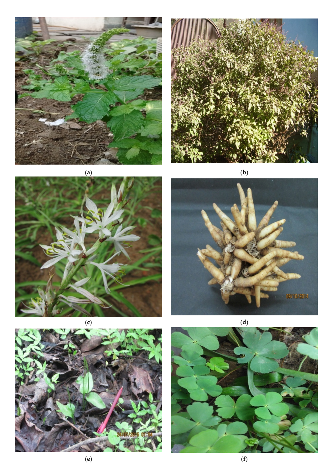
Figure 4. Herbaceous edible plants (mostly leaves): (a) Mentha spicata; (b) Ocimum sanctum; (c) Chlorophytum tuberosum with flower; (d) Roots of Chlorophytum tuberosum; (e) Ophioglossum reticulatum; (f) Marsilea minuta.