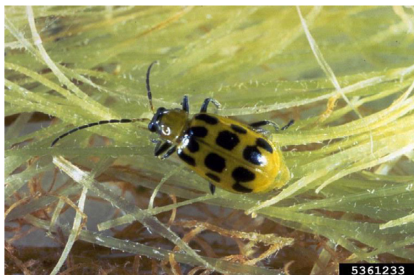
Figure 1: Adult Diabrotica undecimpunctata howardi .