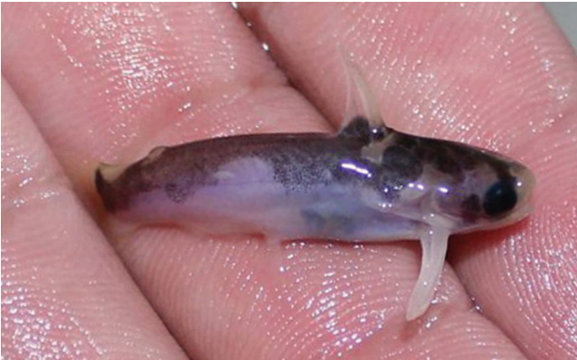
Fig. 2. Life coloration of specimen of Tatia melanoleuca collected in rio Jamanxim, tributary to upper rio Tapajós basin.

Distribution. Examined specimens of Tatia melanoleuca all originated from the rio Teles Pires in the rio Tapajós catchment in the southern portion of the Amazon basin (Fig. 3). Photographed (but not vouchered) evidently conspecific specimens originated in the rio Jamanxim (see Color in Life above), a right bank tributary of the rio Tapajós immediately north of the rio Teles Pires.