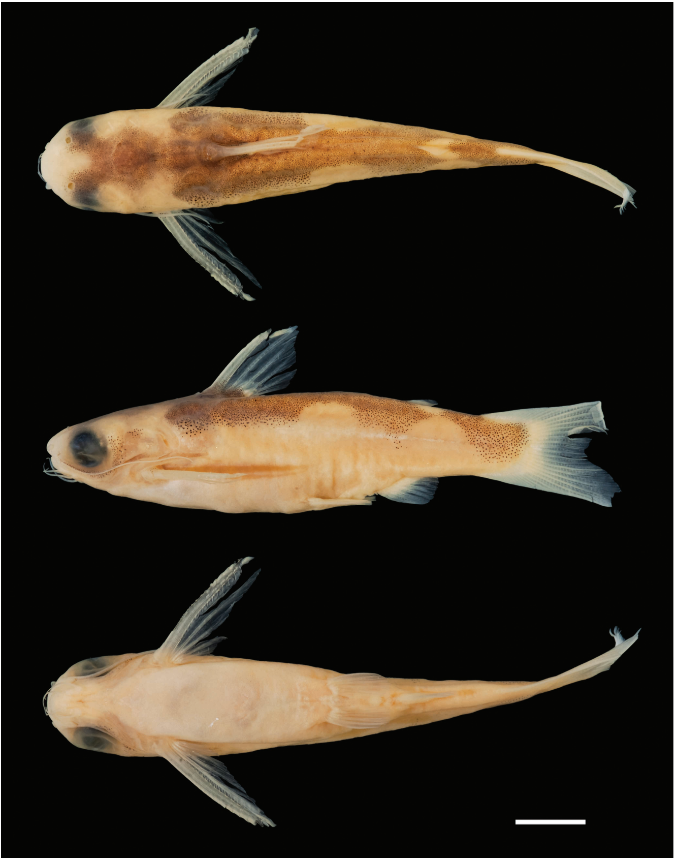
Fig. 1. Tatia melanoleuca , new species, MZUSP 114670, holotype, female, 32.4 mm SL, Brazil, along border between Pará and Mato Grosso states, Jacareacanga, rio Teles Pires, close to Sete Quedas, upper rio Tapajós basin; dorsal, lateral and ventral views. Scale bar = 0.5 cm.