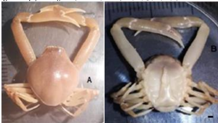
Fig. 2 - Hiplyra elegans (Gravier, 1920). A, B, ♂; C, D, ♀. Scales: 1mm.

1♂, CL. 16.00 mm, CB.15.40 mm; 1♀ CL. 18.0 mm, CB. 16.80mm in deep 6-12 m (MSC).