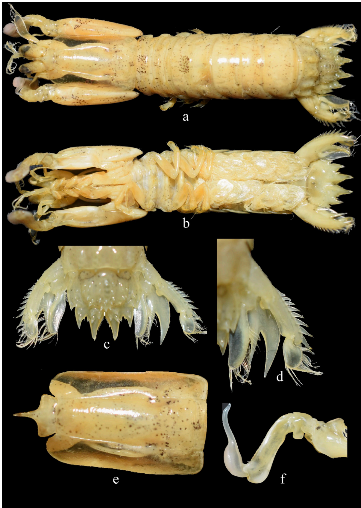
Image 1. Gonodactylellus demanii (Henderson, 1893), Male, TL 35 mm, Goose Reef, FRSACS-01: a—dorsal view | b—ventral view | c—telson | d—uropod | e—carapace | f—raptorial claw.