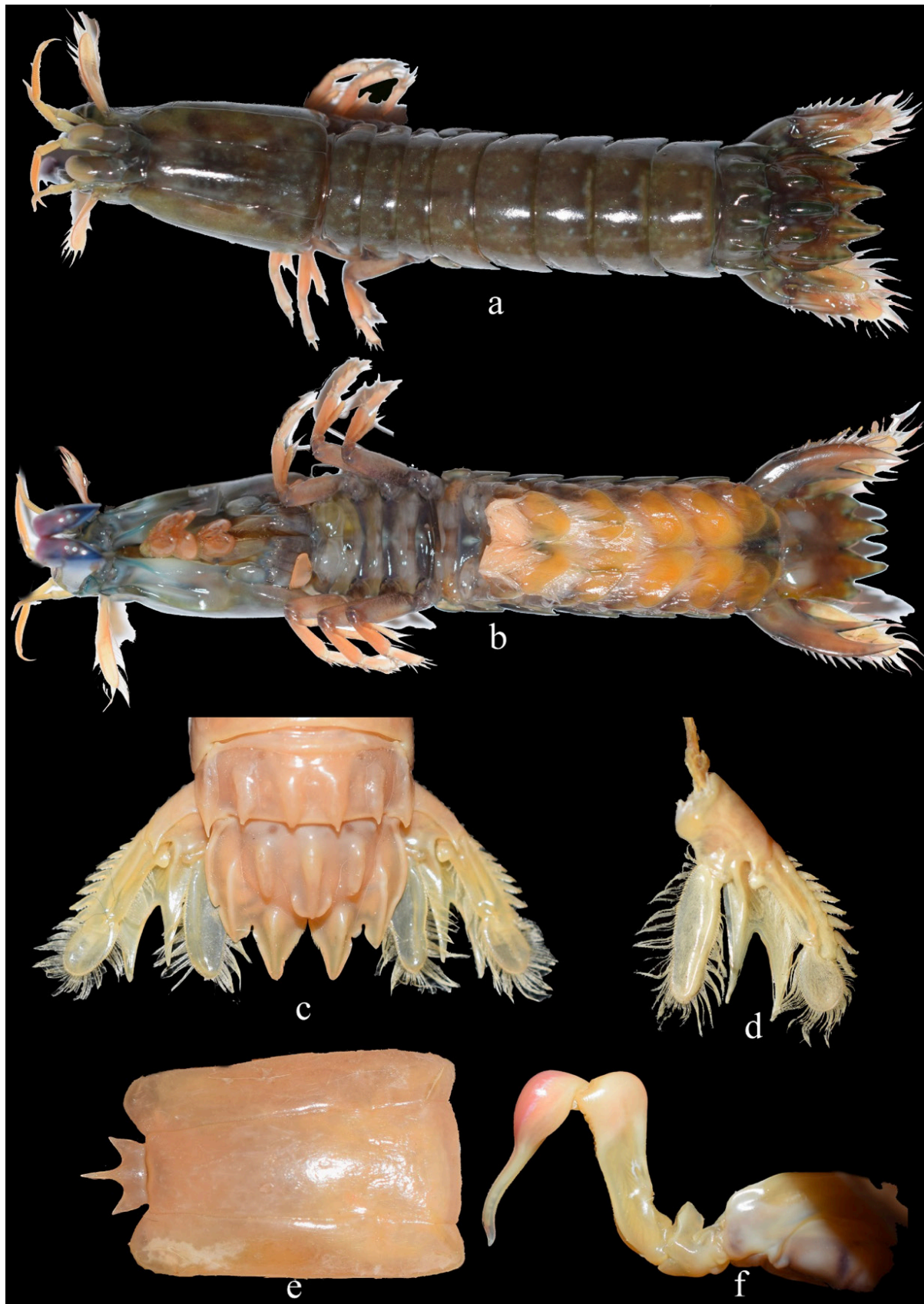
Image 2. Gonodactylus smithii Pocock, 1893, Male, TL 70 mm, Goose Reef, FRSACS-02: a—dorsal view | b—ventral view | c—telson | d—uropod | e—carapace | f—raptorial claw.