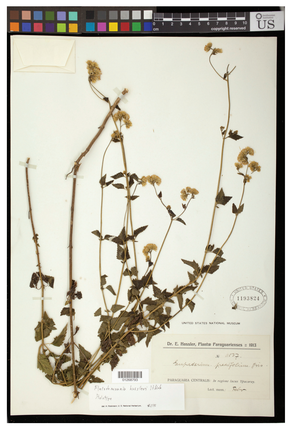
Figure 1. Fleischmannia hassleri H.Rob., holotype (US).