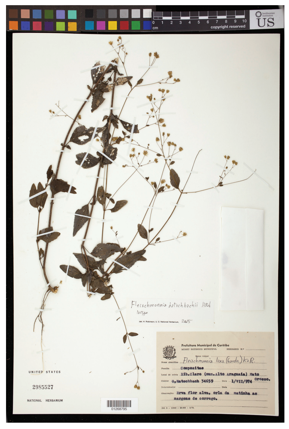
Figure 2. Fleischmannia hatschbachii H.Rob., isotype (US).