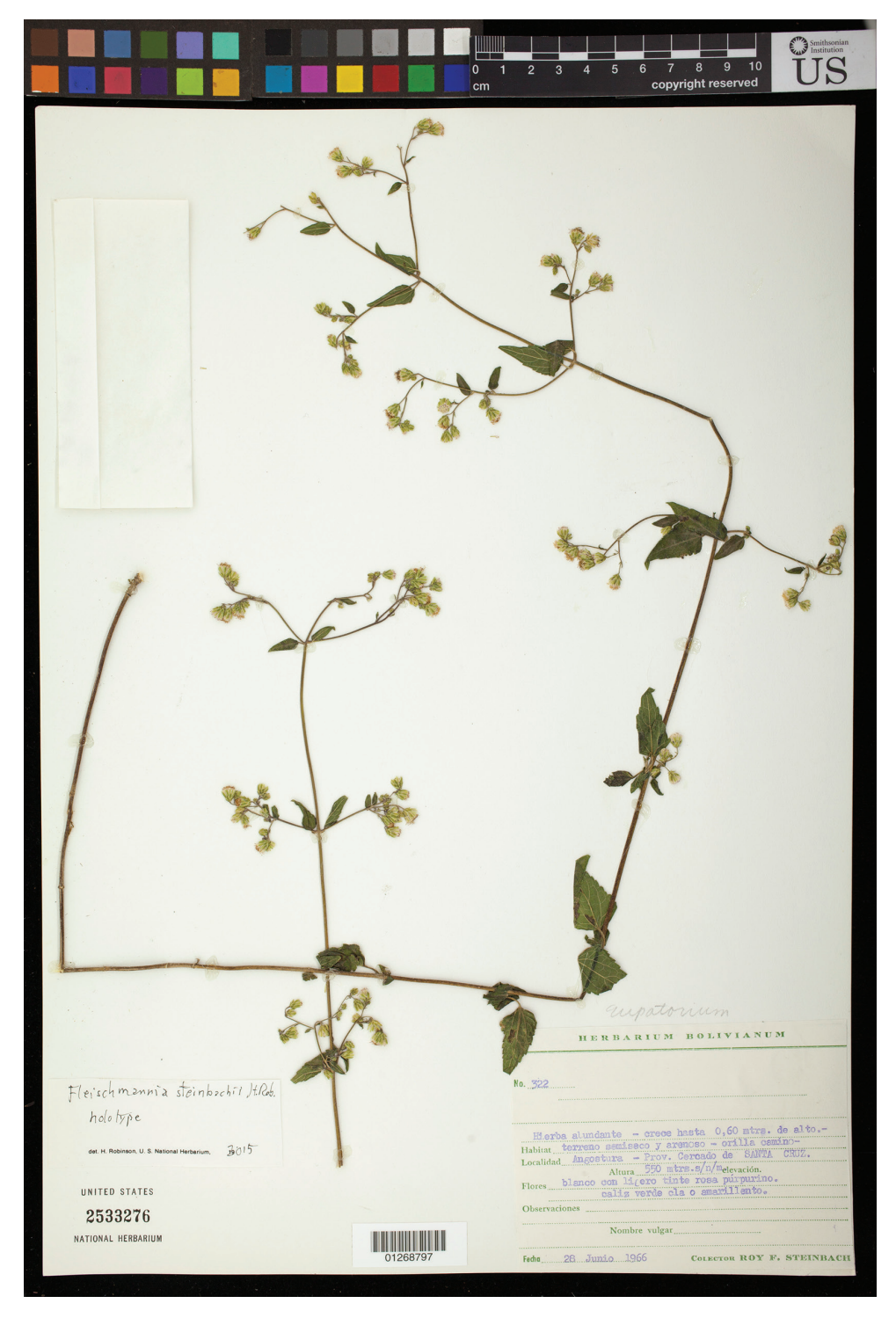
Figure 6. Fleischmannia steinbachii H.Rob., holotype (US).