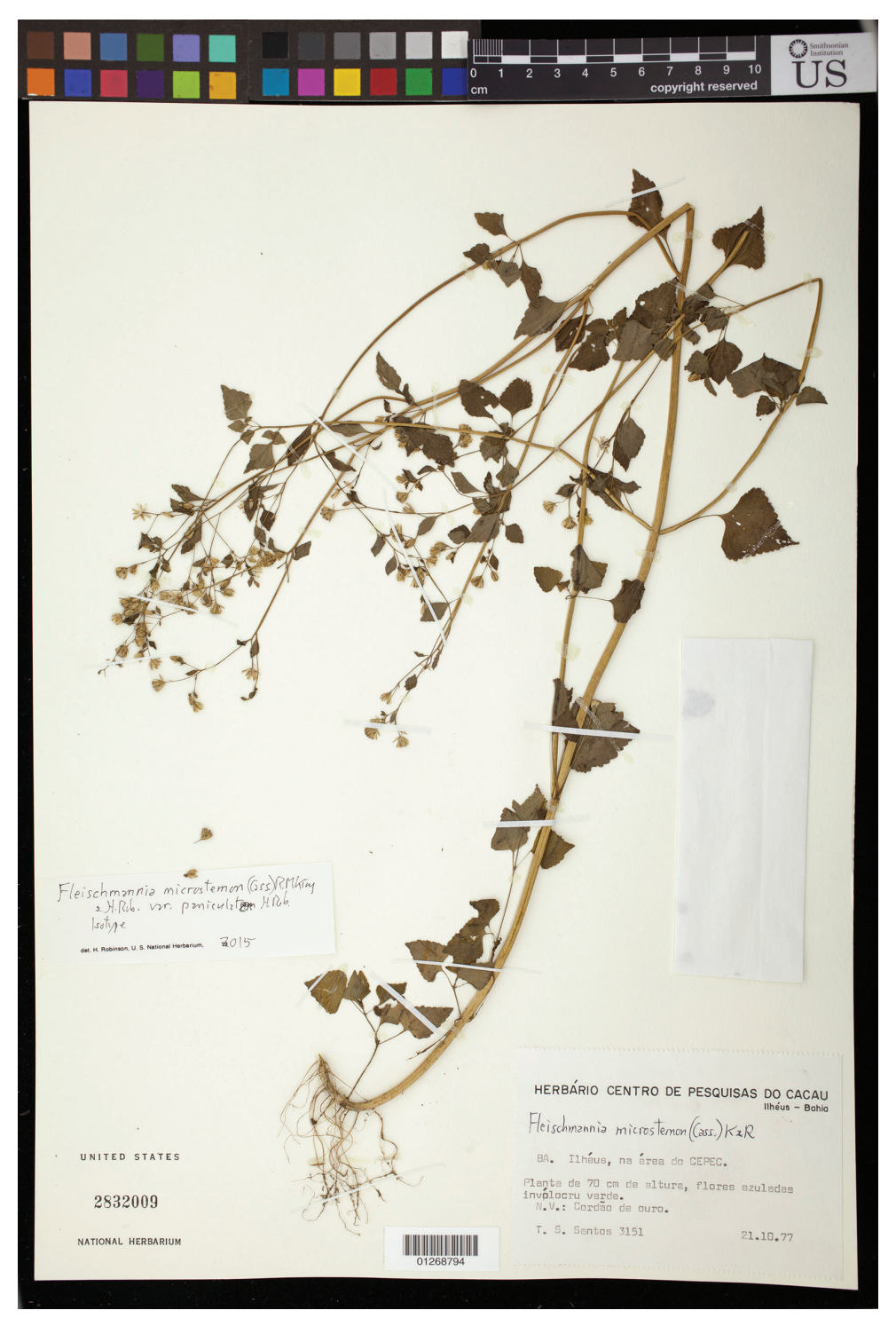
Figure 4. Fleischmannia microstemon var. paniculata H.Rob., isotype (US).