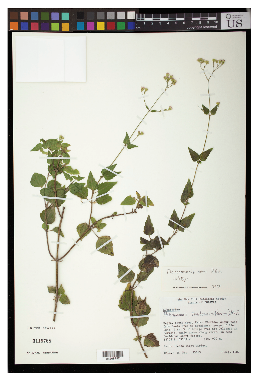
Figure 5. Fleischmannia neei H.Rob., holotype (US).