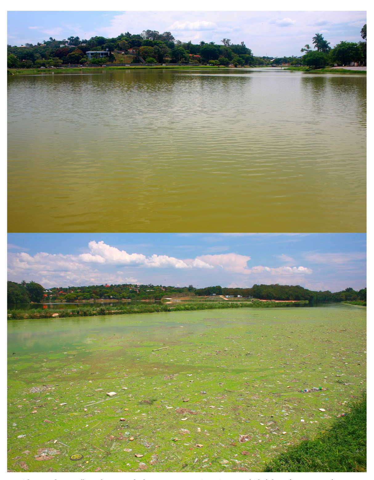
Fig 5. The Lagoa da Pampulha, at downtown of Belo Horizonte, Minas Gerais State, Brazil. The habitat of Hypostomus subcarinatus . https://doi.org/10.1371/journal.pone.0207328.g005