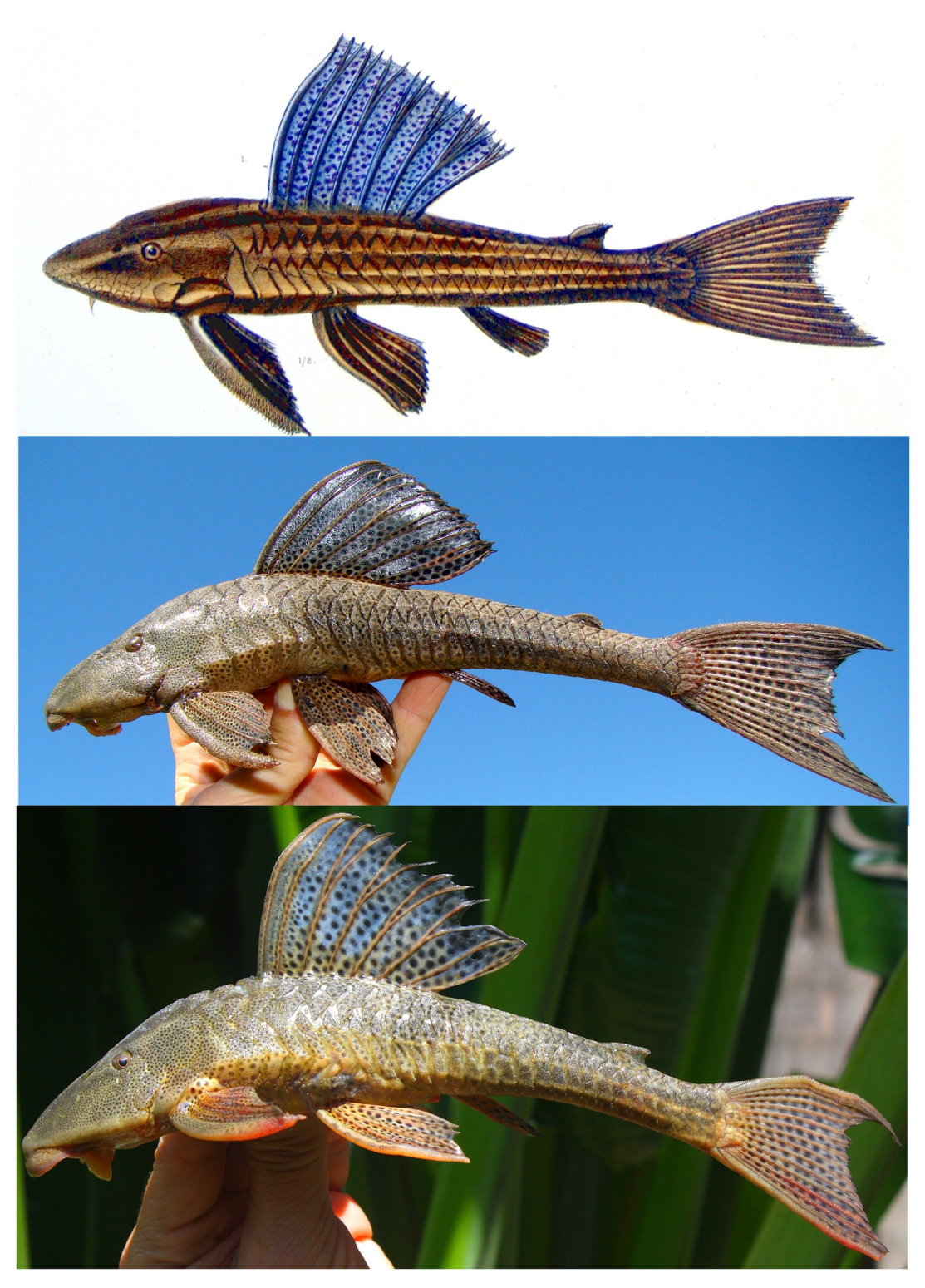
Fig 3. The Castelnau's (1855) drawing of Hypostomus subcarinatus , MNHN A 9575, 241.8 mm SL, holotype, Brazil, Province de Mines [state of Minas Gerais], is depicted in the upper picture and compared to two live specimens photographed immediately after capture: MCNIP 1761, middle picture 227.2 mm SL and lower picture 196.5 mm SL, both from the Lagoa da Pampulha, Belo Horizonte, Minas Gerais State, Brazil.

https://doi.org/10.1371/journal.pone.0207328.g003