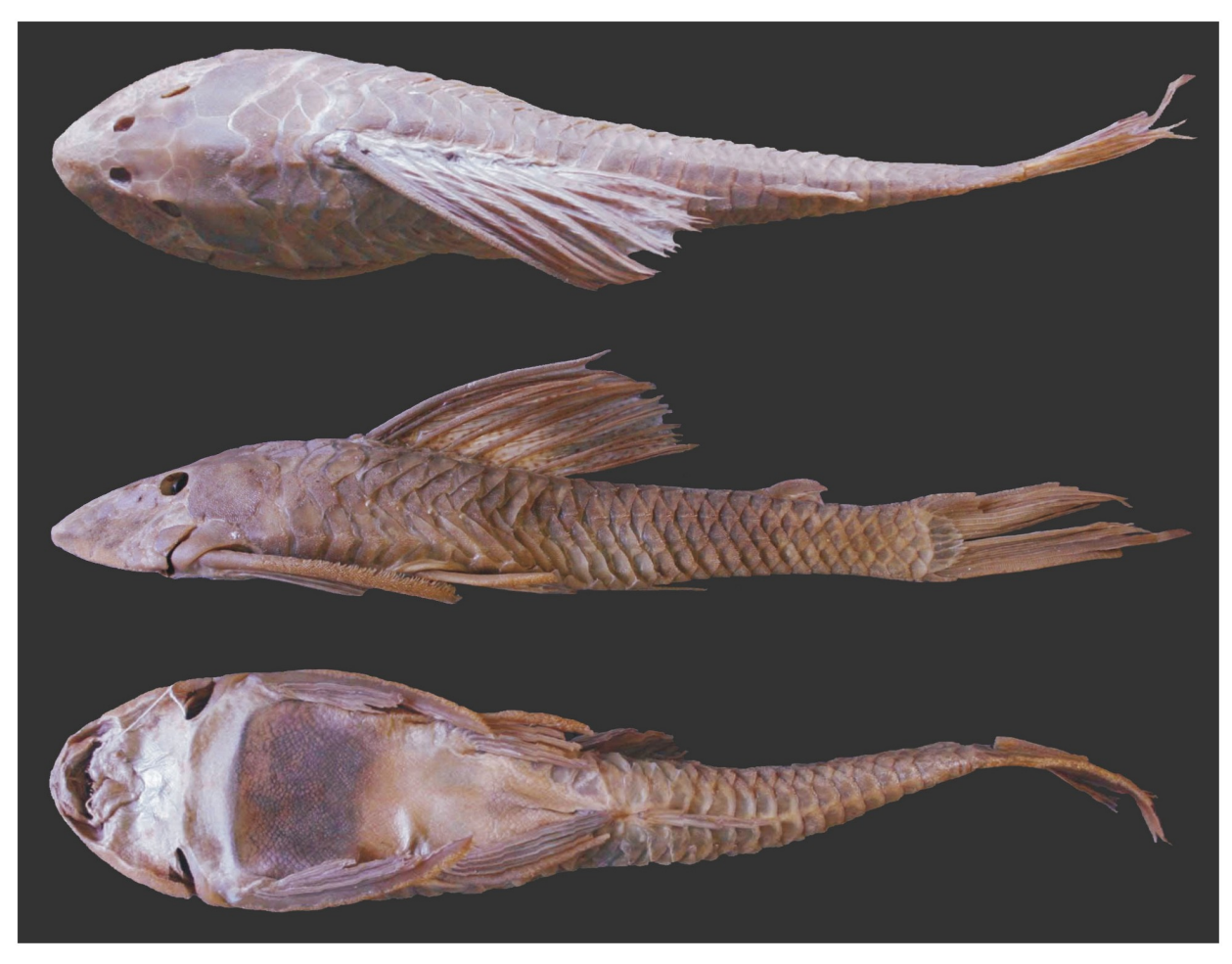
Fig 1. Hypostomus subcarinatus , MNHN A, 9575, 241.8 mm SL, holotype, Brazil, Province de Mines [state of Minas Gerais]. https://doi.org/10.1371/journal.pone.0207328.g001