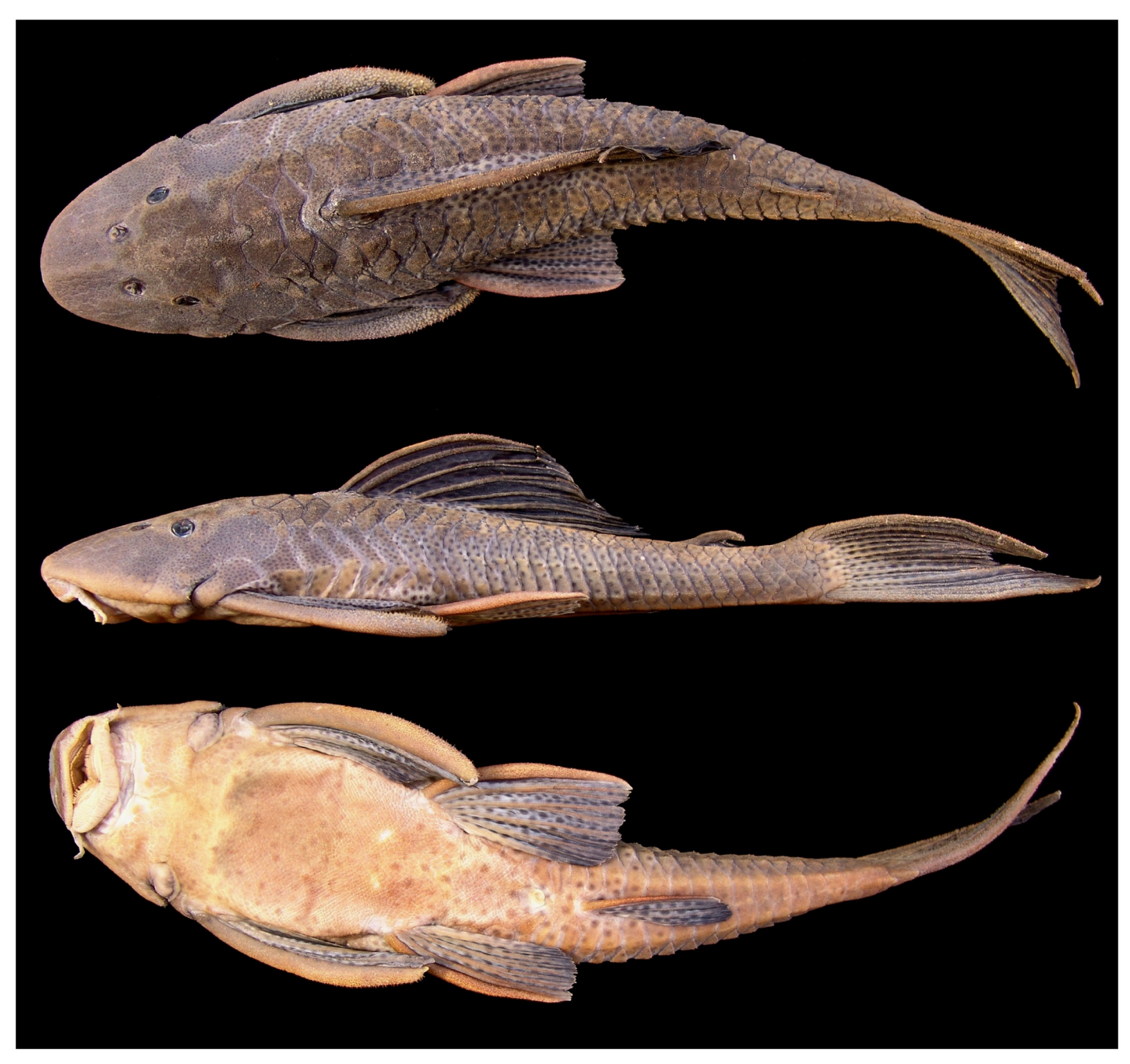
Fig 2. Hypostomus subcarinatus, MCNIP 1103, 249.5 mm SL. Lagoa da Pampulha, Belo Horizonte, Minas Gerais State, Brazil.

https://doi.org/10.1371/journal.pone.0207328.g002