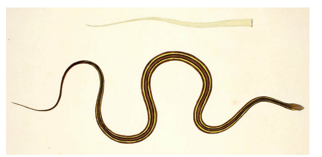
Image 3. Coluber condanarus. Reproduction of the lectotype's drawing in plate 27 of Russell (1796)

Smith (1943) described the Indo-Chinese population of P. condanarus as subspecies P. condanarus indochinensis based on the differences in ventral, subcaudal counts and dorsal stripe patterns. Later it was given full species status by Hughes (1999) in his review on primarily African species. Psammophis