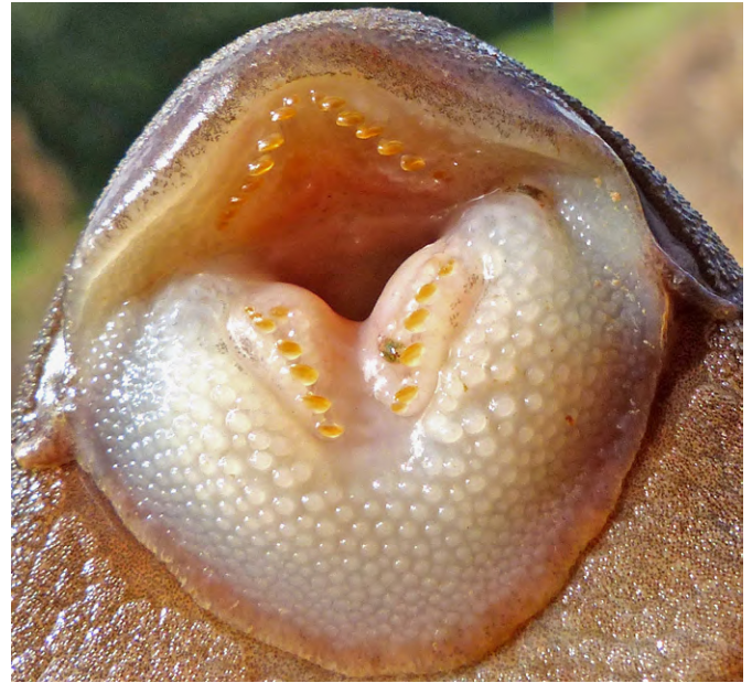
Figure 3. Hypostomus cochliodon , CI-FML 7093, 100.8 mm SL, live specimen, Bermejo River, Salta province, Argentina. Teeth in detail.