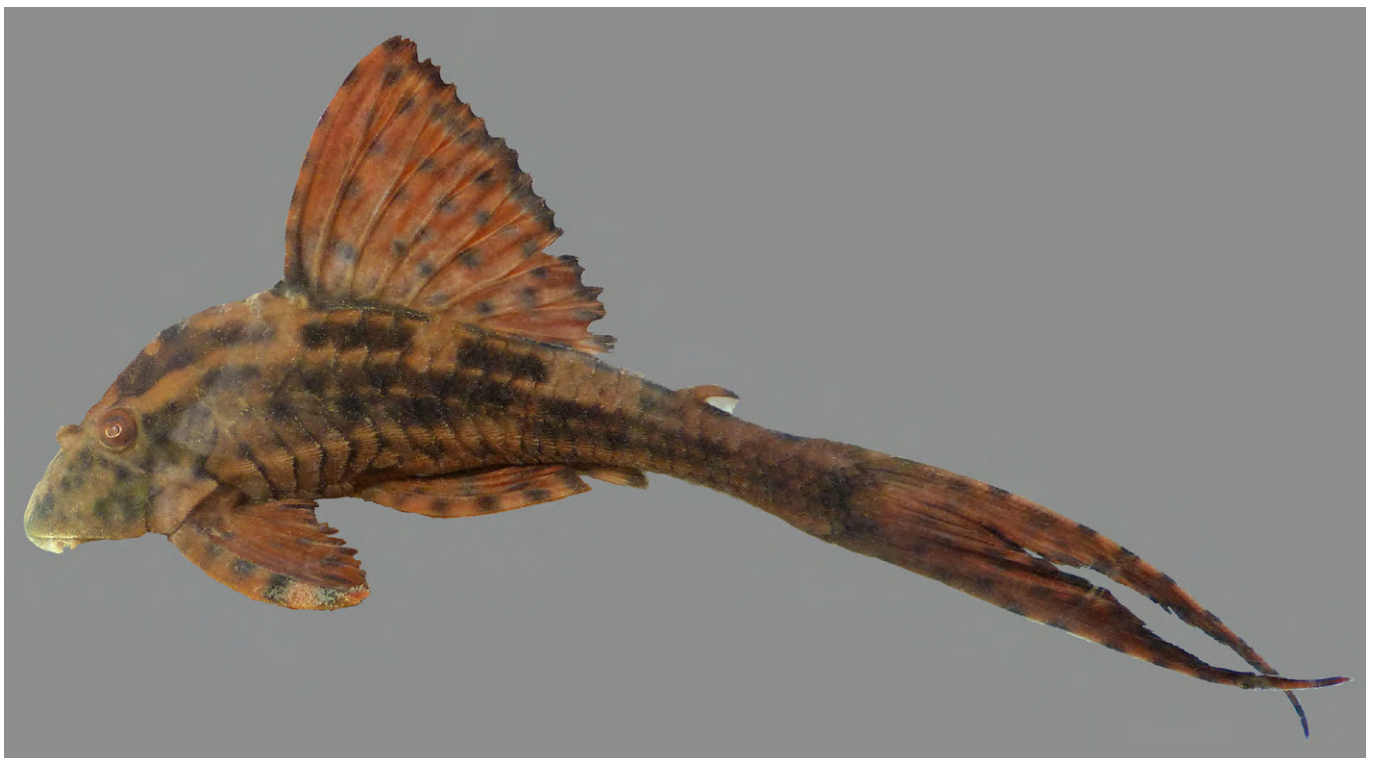
Figure 4. Hypostomus cochliodon , CI-FML 7093, 100.8 mm SL, live specimen, Bermejo River basin, Salta province, Argentina.