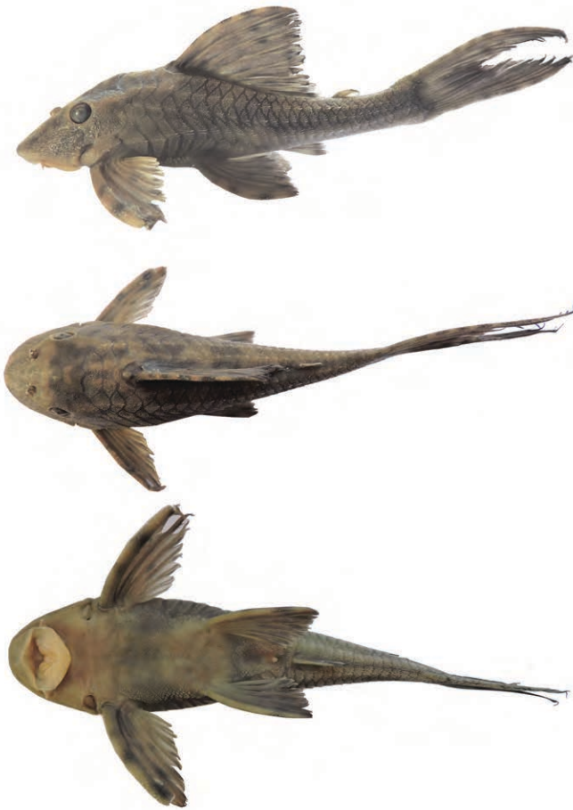
Figure 2. Hypostomus cochliodon , CI-FML 7091, 86.1 mm SL, Bermejo River, Salta province, Argentina; lateral, dorsal, and ventral views.

The upper Bermejo River basin has rocky bottoms and moderately fast to fast-flowing waters that run from west to east through the Andes to the chacoan plain. Rains are mainly concentrated in summer and most rivers in the area have a highly torrential regime during that period with high amounts of suspended particles and turbidity, while the volume of water is considerably diminished during the rest of the year