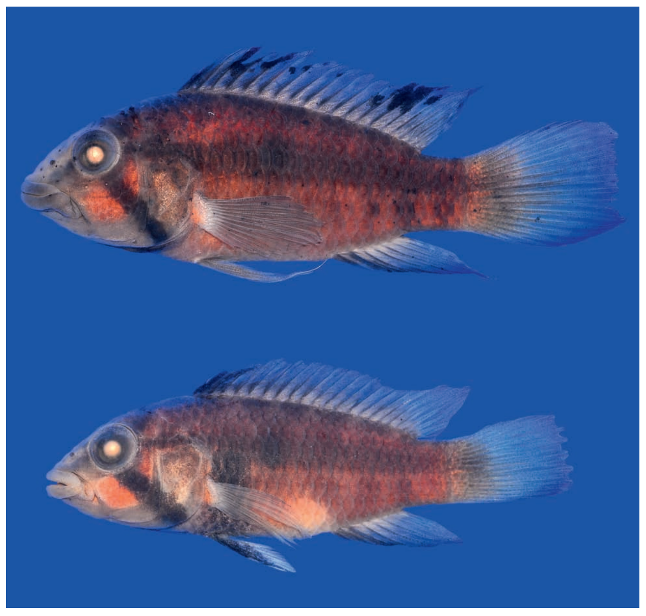
Fig. 2 . Apistogramma barlowi sp. n., paratypes, MTD F 30774; bottom: female, 31.4 mm SL, normal colour pattern; top: male, 40.1 mm SL, showing abnormal colour pattern of irregular black spots.