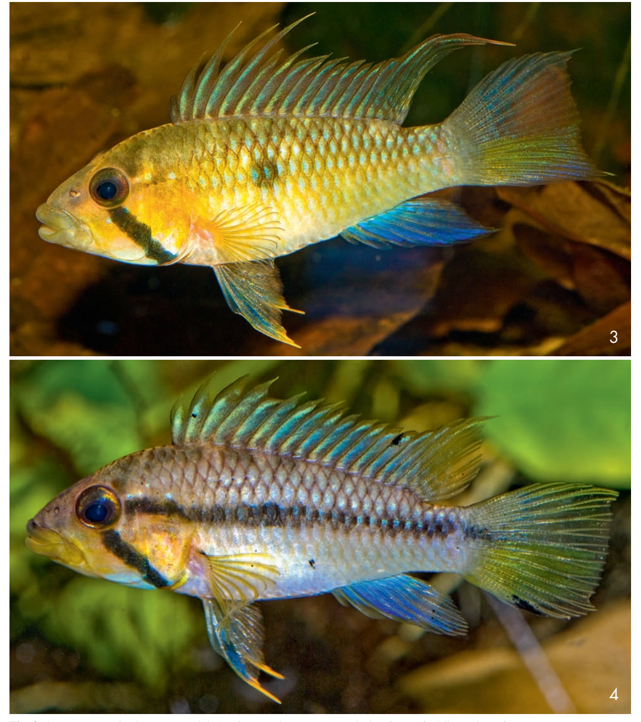
Fig. 3. Apistogramma barlowi sp. n., adult dominant male, not preserved, showing typical live colouration.