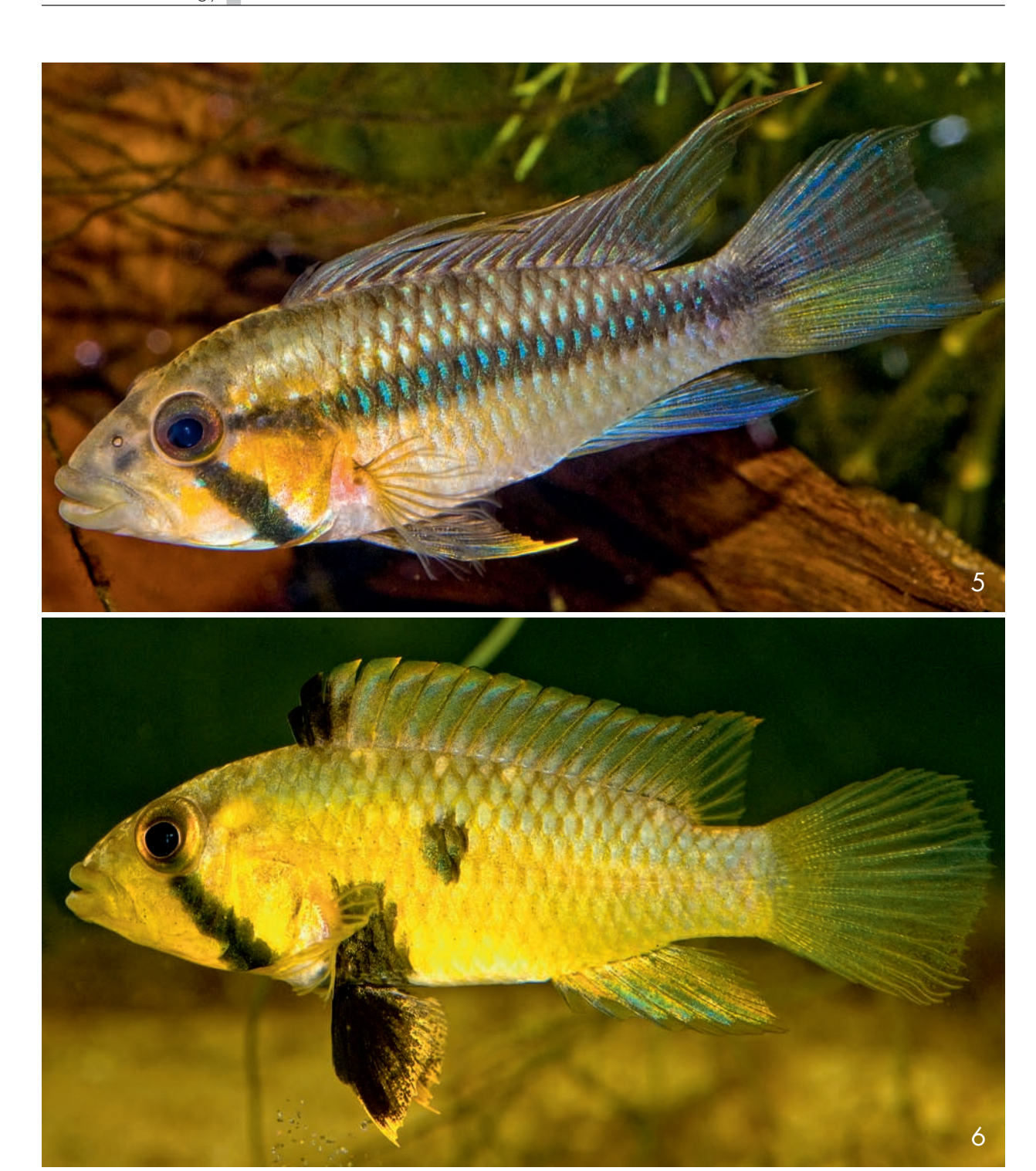
Fig. 5. Apistogramma barlowi sp. n., sub-adult male, not preserved, showing rarely visible lateral band.