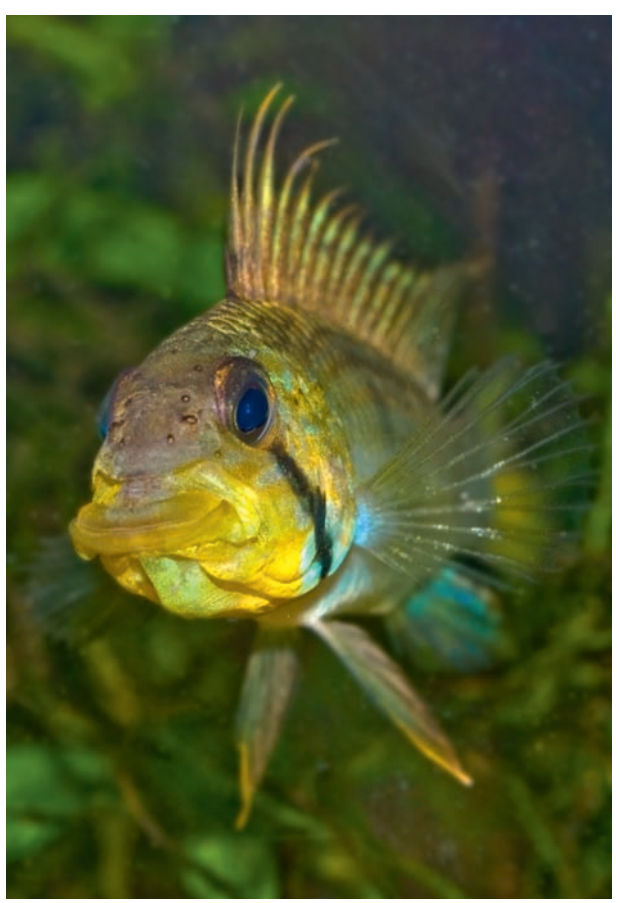
10 . Apistogramma barlowi sp. n., adult male, not preserved, frontal view while mouth-breeding.

on his aquarium observations on the species, including a photograph of a collecting site as well as field data collected at the end of the dry season in October/ November 2006 by Tom Christoffersen, who independently confirmed most of the known data. CHRIST-OFFERSEN collected a reddish morph of Apistogramma barlowi sp. n. in a small clearwater igarapé, about one meter wide and approximately 30 cm deep, with fine white sand as bottom substrate, no submerged vegetation, rocks or pebbles, a pH of 4.8, electrical conductivity of 26 \mu S/cm at a temperature close to 29 °C. The only other Apistogramma-species collected syntope was Apistogramma agassizii (Steindachner, 1875). Judging this data base, distribution and ecology of Apistogramma barlowi sp. n. are only scarcely known and require further studies in the field.