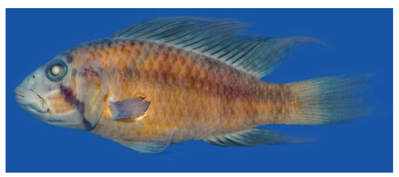
Fig. 1. Apistogramma barlowi sp. n., holotype, MTD F 30777, male, 60.0 mm SL.