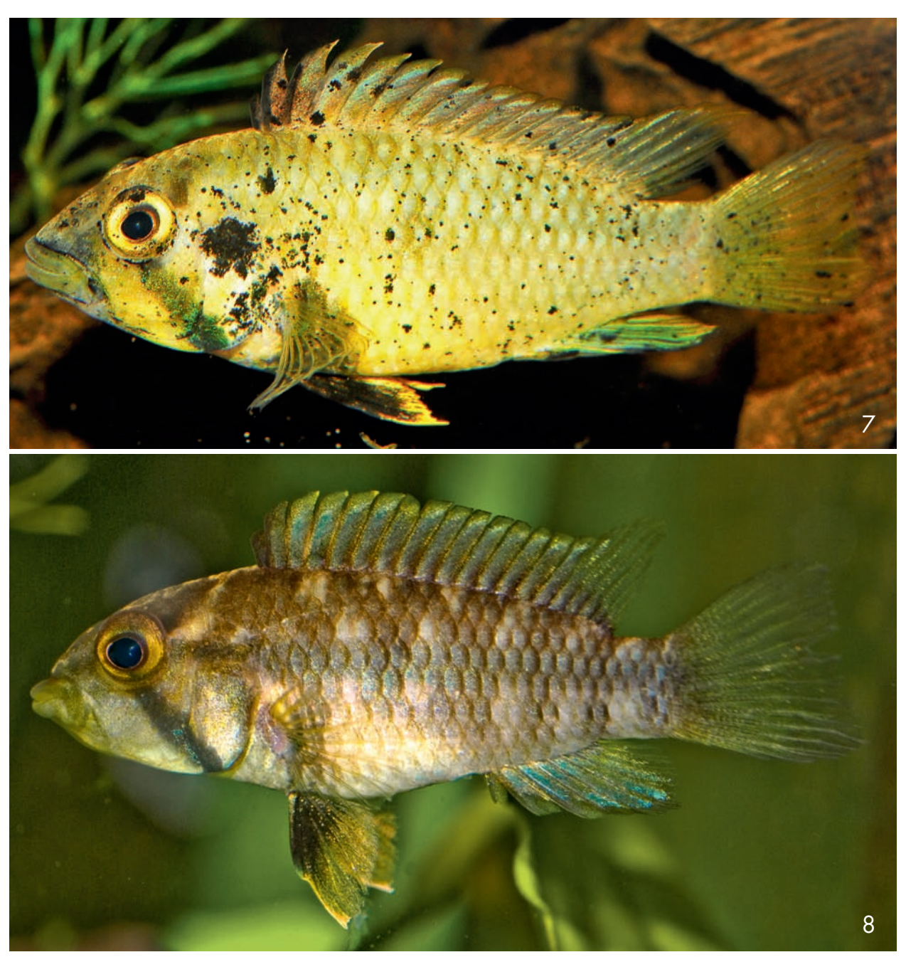
Fig. 7. Apistogramma barlowi sp. n., adult female, not preserved, specimen in breeding colouration showing extreme irregular black spot pattern caused by unspecified disease.