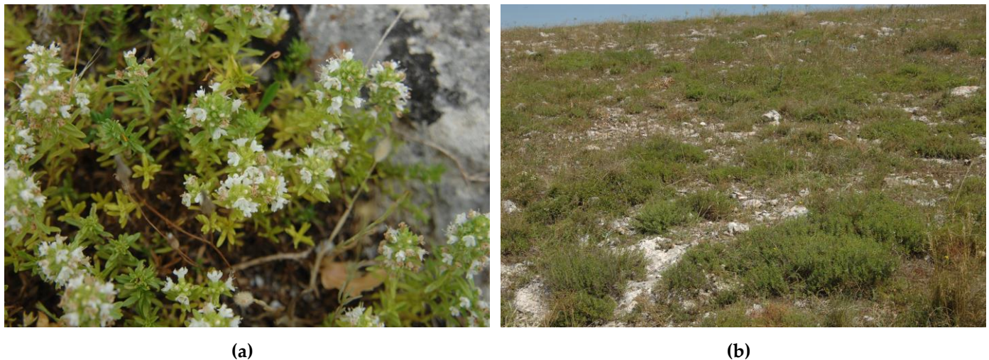
Figure 4. Th. spinulosus (a) in flowering; (b) in its habitat, Hippocrepido glaucae-Stipion austroitalicae . Scannapocora, 03.06.2020.

Th. spinulosus (synonym: Th. paronychioides Celak.) is shown in Figure 4.