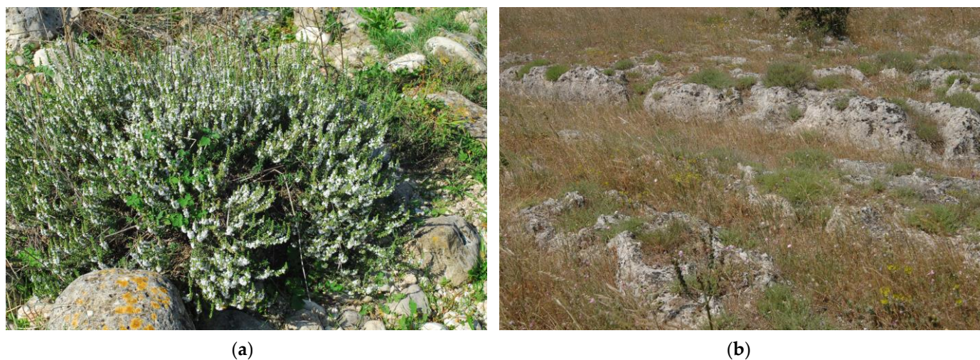
Figure 2. S. cuneifolia (a) in flowering; (b) in its habitat, Phagnalo saxatili - Saturejetum cuneifoliae . San Basilio, 26 March 2020.