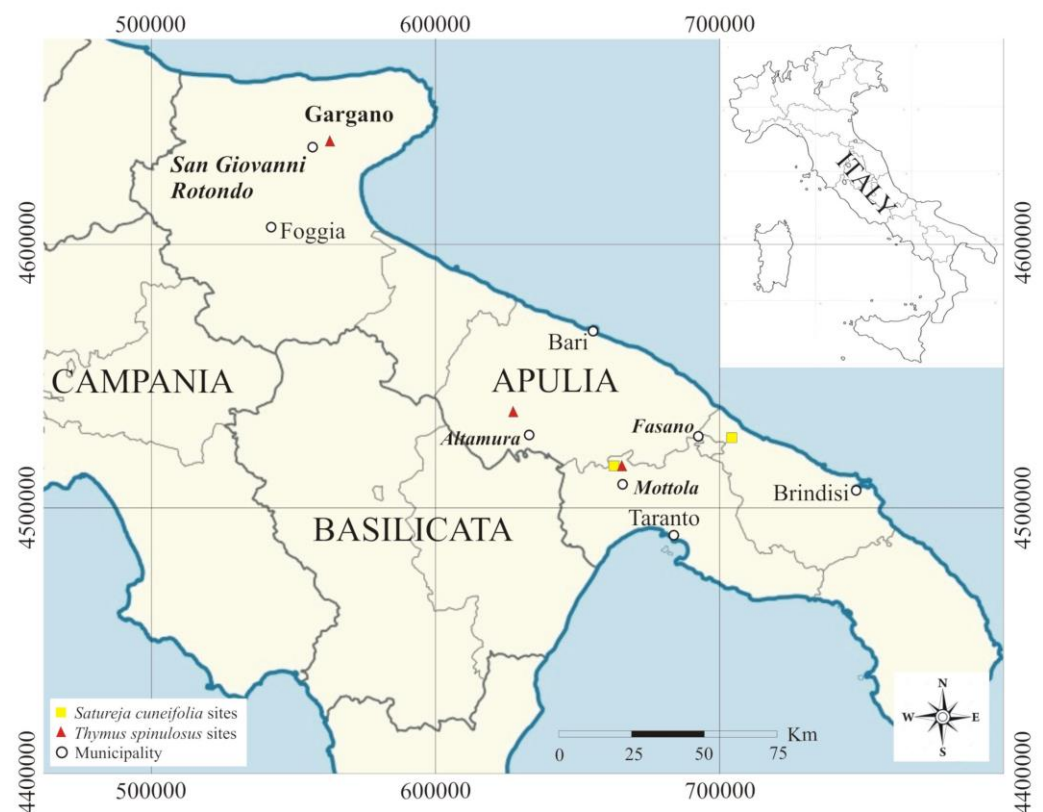
Figure 1. Site locations of Satureja cuneifolia and Thymus spinulosus .

Within the San Basilio site in the province of Taranto, the most widespread pedo-type is Lithic Ruptic–Inceptic Haploxeralf fine, predominantly clayey, very thin, and very rocky with substrate within 50 cm [21]. At Scannapecora in the province of Bari, the geological type is that of Skeletal limestones of neritic and carbonate platform facies (Upper Cretaceous), on Tyrrhenian carbonate reliefs with material defined by calcareous sedimentary rocks and climate from Oceanic to Suboceanic Mediterranean, partially mountainous. The Difesa di Malta and S. Egidio sites share the same ecopedology as the Scannapecora site but different geopedology and geolithology, respectively, with Terrigenous-skeletal limestones such as “Panchina” (Pleistocene) and Colluvial, terraced alluvial, fluviolacustrine and fluvioglacial deposits (Pleistocene) (Geological, Geolithological and Ecopedologic maps—Italian Ministry for the Environment, Land and Sea, http://www.pcn.minambiente.it/viewer , accessed on 26 May 2021) [20] (Table 2).