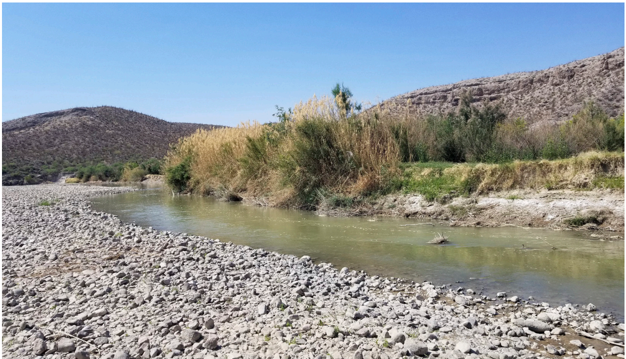
Figure 3. Rio Grande at the confluence with Alamito Creek (Presidio Co., Texas, 16 April 2018). The dry bed of Alamito Creek, representing the northern (USA) shoreline, is shown in the foreground.