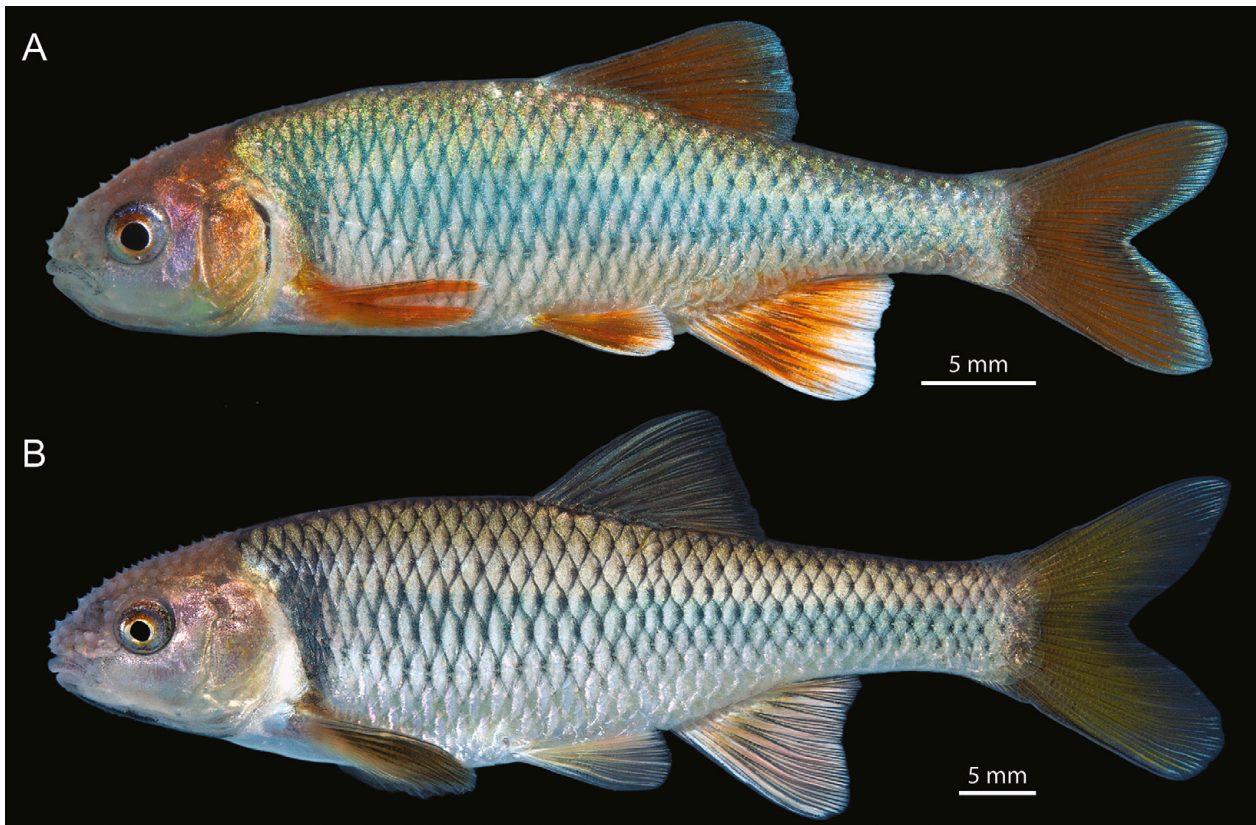
Figure 1. A. Cyprinella panarcys , TCWC 19724.01, male, 36.0 mm SL; Rio Grande, Presidio Co., Texas, USA; pectoral fin split at center. B. Cyprinella proserpina , TCWC 16885.09, male 60.0 mm SL; Independence Creek, Terrell Co., Texas, USA.

collected over cobble substrate in water of moderate flow (0.61 m/s) and depth (1.07 m). Other species collected at this site together with C. panarcys included: C. lutrensis , Macrhybopsis aestivalis (Girard, 1856), Notropis braytoni Jordan & Evermann, 1896, Rhinichthys cataractae (Valenciennes, 1842) (Cyprinidae), Carpiodes carpio (Rafinesque, 1820), Cycleptus sp. cf. elongatus (Lesueur, 1817) (Catostomidae), Pylodictis olivaris (Rafinesque, 1818) (Ictaluridae), and Gambusia affinis (Baird & Girard, 1853) (Poeciliidae).