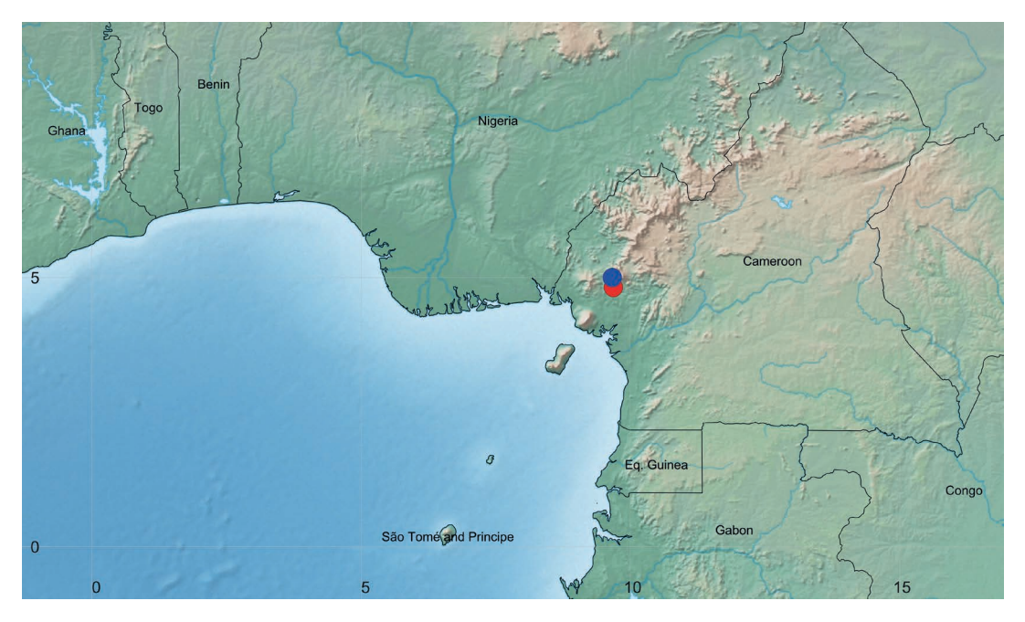
Figure 3 - Cola etugei (red dot) and Cola kodminensis (blue dot) global distribution.

The specimen Cheek 9682 was identified as a new species " Cola sp. nov. kodminensis " in Cheek et al. (2004). However, David Kenfack, visiting Kew before that book was published, asserted that the specimen was conspecific