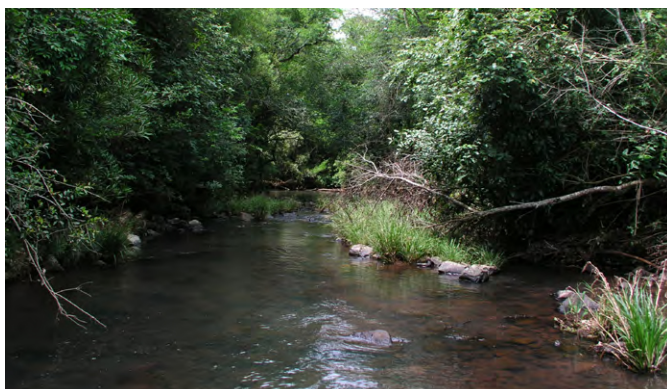
Figure 9. Shangay stream, Colonia Tres Bocas, Departamento 25 de Mayo, Misiones, Argentina.