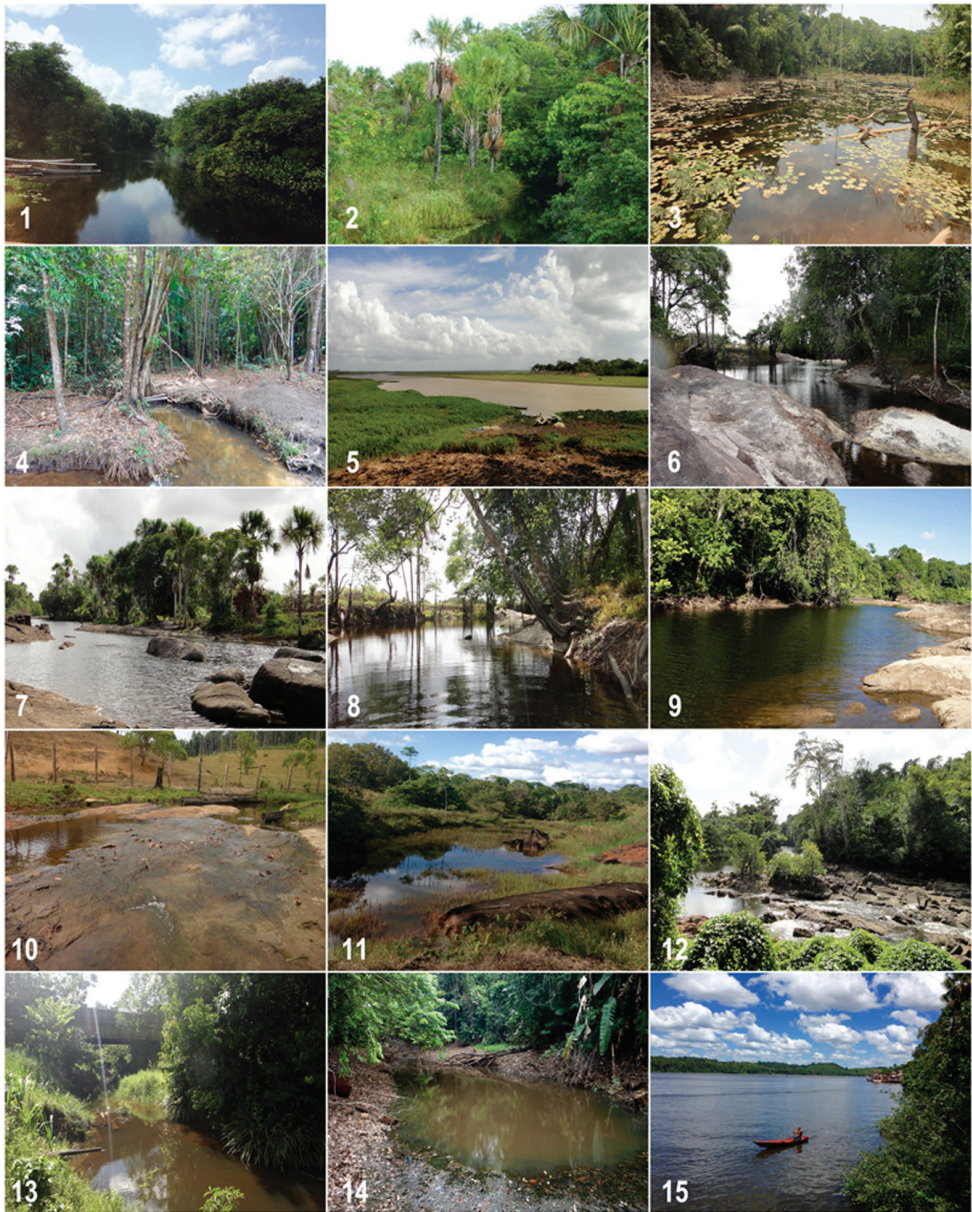
Figure 2. Sampled localities in the Amapá, northern Brazil. Numbers follow Table 1 and Fig. 1.

formes (55%), Cichliformes (16.6%), Siluriformes (14.1%) and Gymnotiformes (7.5%) as expected in Neotropical freshwaters (e.g. Langeani et al. 2007; Vari et al. 2009; Polaz et al. 2014). These four orders represent 93.3% of the total species richness. Clupeiformes ( Anchovia ), Cyprinodontiformes ( Fluviphylax and Melanorivulus ), Gobiiformes