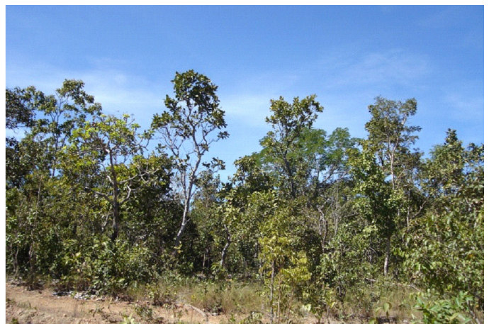
FIGURE 3. Cerrado stricto sensu in Tocantins river middle basin located in the municipality of São Salvador do Tocantins (TO), Brazil.