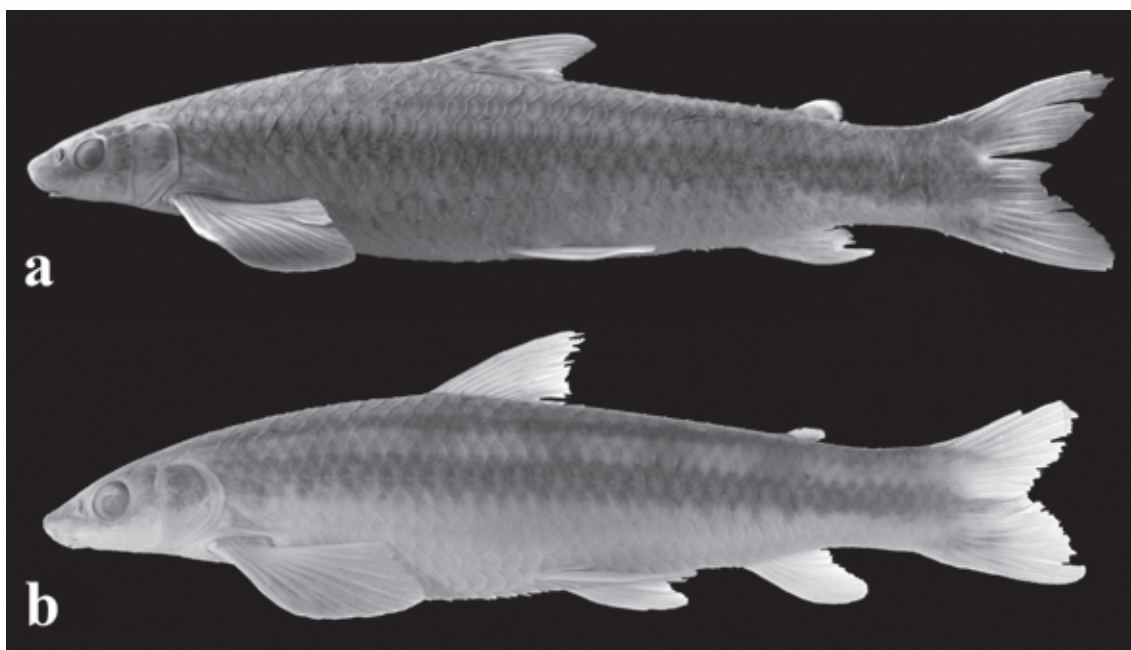
Fig. 1. Parodon orinocensis : (a) MBUCV-V 29170, holotype, 131.9 mm SL, Raudal Dimoshi; (b) AMNH 233108, 99.4 mm SL, Raudal del Danto.

transverse bars instead of a mid-lateral stripe) and from P. guyanensis , P. moreirai Ingenito & Buckup, 2005, P. pongoensis (Allen, 1942), and Apareiodon species (in which the mid-lateral stripe lacks dorsal or ventral projections). The mid-lateral stripe pattern found on P. orinocensis is also present in other congeners ( P. alfonsoi , P. atratoensis , P. bifasciatus Eigenmann, 1912, P. buckleyi Boulenger, 1887, P. carrikeri Fowler, 1940, P. hilarii Reinhardt, 1866, P. magdalenensis , P. nasus Kner, 1859, and P. suborbitalis ). From these species P. orinocensis can be distinguished by its very pointed snout ( versus rounded), and the strongly rounded cutting edges of the premaxillary teeth ( versus straight or almost straight). Additionally, the three sympatric congeners of P. orinocensis from the Río Orinoco basin can be easily distinguished from it as follows: P. apolinari has longer supraoccipital process to isthmus distance (1.2-1.5 versus 1.6-1.9 times in HL), deeper body (3.4-4.1 versus 4.2-5.3 times in SL), and 36-38 lateral-line scales ( versus 40-43); P. guyanensis has five premaxillary teeth ( versus four) and distal one-third of dorsal fin dark ( versus not dark); P. suborbitalis has 36 to 39 lateral-line scales ( versus 40-43), larger adipose to anal-fin distance (5.0-5.9 versus 6.0-7.7 times in SL), and larger supraoccipital process to isthmus distance (1.0-1.5 versus 1.6-1.9 times in HL).