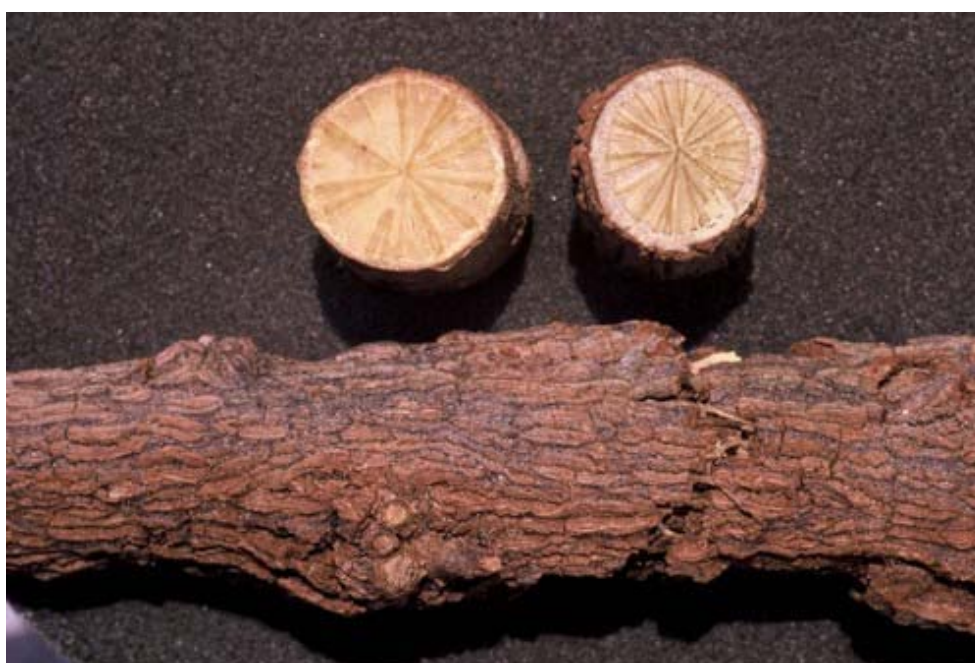
Figure 1. Rhizome of Cissampelos capensis .

The genus Cissampelos L. is one of seven genera of the Menispermaceae indigenous to southern Africa. In many regions of the world, members of the family are well known for their medicinal uses, which are associated with their rich diversity of isoquinoline alkaloids [2]. The genus is represented in southern Africa by four species: C. capensis , C. hirta Klotzsch, C. mucronata A. Rich. and C. torulosa E. Mey. ex Harv. [3]. Cissampelos capensis is the only endemic species in southern Africa and occurs in the winter rainfall region. The plant is a rambling shrub with thick, divergent branches and twining stems. Inland populations show xerophytic adaptations (small glaucous leaves) but along the coast the leaves tend to be larger and less glaucous [4,5,6]. Cissampelos capensis is of special significance in Khoisan ethnomedicine [3,7,8]. The rhizomes, known as “dawidjies” or “dawidjiewortel” (Figure 1) are widely used in traditional medicine as a blood purifier and a diuretic medicine [1].