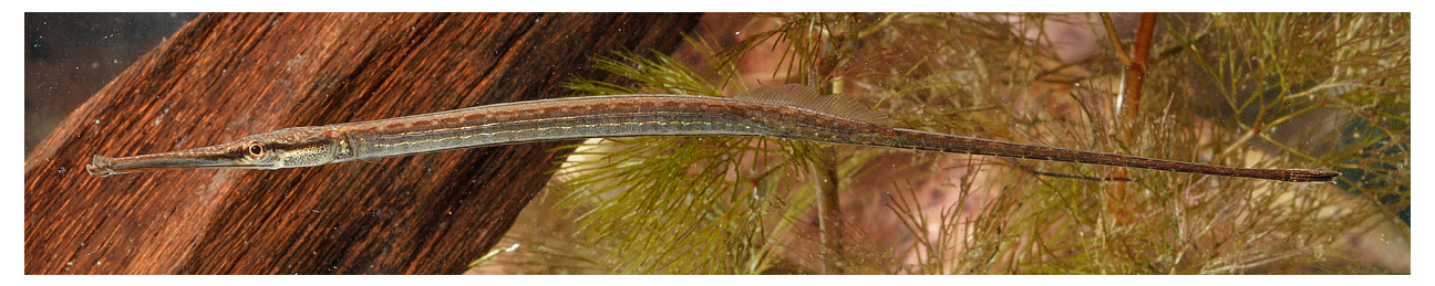
Figure 2. Microphis brachyurus lineatus, female, DMM IE/14883, 103.4 mm SL, Suriname River at Overbridge, Suriname, live.

W, at km 105 of river), coll. by T. Moritz, P. Thieme, P. Warth, V. von Vietinghoff & K. Wan Tong You, 12 February 2018 (2 specimens). Suriname: Para District: lower Suriname River, western bank in the southern part of Overbridge Resort (05°31′49″ N, 055°03′00″ W, at km 105 of river), coll. by T. Moritz, P. Thieme, P. Warth, V. von Vietinghoff & K. Wan Tong You, 12 February 2018 (1 specimen).