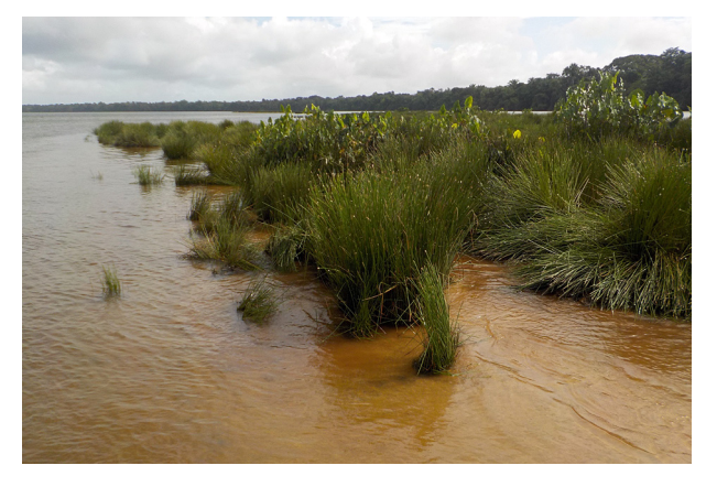
Figure 3. Vegetated sand bank in the middle of the Suriname River close to Overbridge, Suriname, with the emergent aquatic macrophytes Eleocharis and Montrichardia and submerged Mayaca fluviatilis .

Live pictures were taken on the day of capture (Fig. 2). All specimens were collected in vegetation; at the sandbank in the middle of the river in flooded stands of Eleocharis Brown and Montrichardia Crueger (Fig. 3) and submerged Mayaca fluviatilis Aublet, and in dense aquatic vegetation, predominantly consisting of Cabomba Aublet, along the southwestern bank of the Overbridge Resort. The area in which the specimens were collected is influenced by tidal changes in water level, but the water is fresh (< 300 mg/L Cl) year-round (Fig. 1).