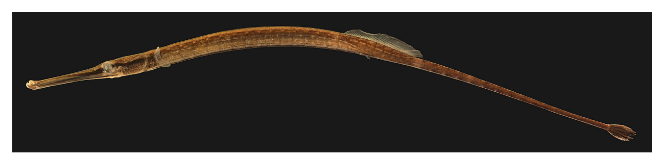
Figure 4. Microphis brachyurus lineatus, female, DMM IE/14883, 103.4 mm SL, Suriname River at Overbridge, Suriname, fixed.

Identification. Five species out of 3 genera of pipe-fish have been recorded from freshwater in South and Central America (Ferraris 2003). The body ridge configuration (Fig. 4) is diagnostic for Microphis , with the anterior ridge running ventrally at the level of dorsal fin origin and thus overlapping with the posterior ridge (Dawson 1984: fig. 1). Within this genus, a single species was reported for South America. Furthermore, Dawson (1984) provided a worldwide key for the genus Microphis , in which the species keys out as M. brachyurus lineatus , by having a distinct longitudinal opercular ridge accompanied by a supplemental ridge, scutella without keel, snout depth 8.1–8.7 times the snout length, snout length 1.62–1.69 times the head length, and 18 trunk rings (Table 1).