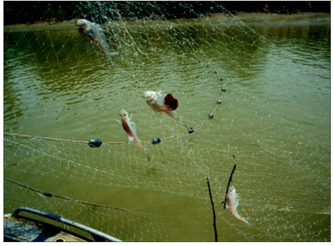
Fig. 3. Male nurseryfish enmeshed in gill net virtually guaranteeing dislodgement of egg mass.