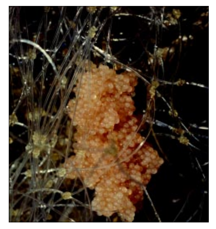
Fig. 1 . Pink Kurtus gulliveri egg mass in gill net taken in Marrakai Creek on 22 October 2003. Egg mass contained embryos with eye spots and tails readily visible under microscope. Eggs about 2 mm in diameter.