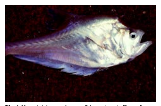
Fig. 6 . Normal right eye of nurseryfish specimen in Figure 5.

was 68% (Fig. 6). The lens was absent from the left eye. This defect is known as a pinhole camera eye (Moore and Curd 1966).