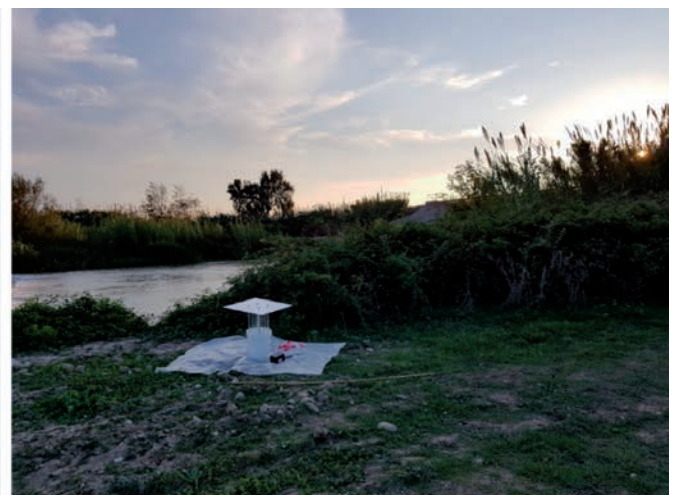
Figure 3. UV-LED light traps for capturing specimens.