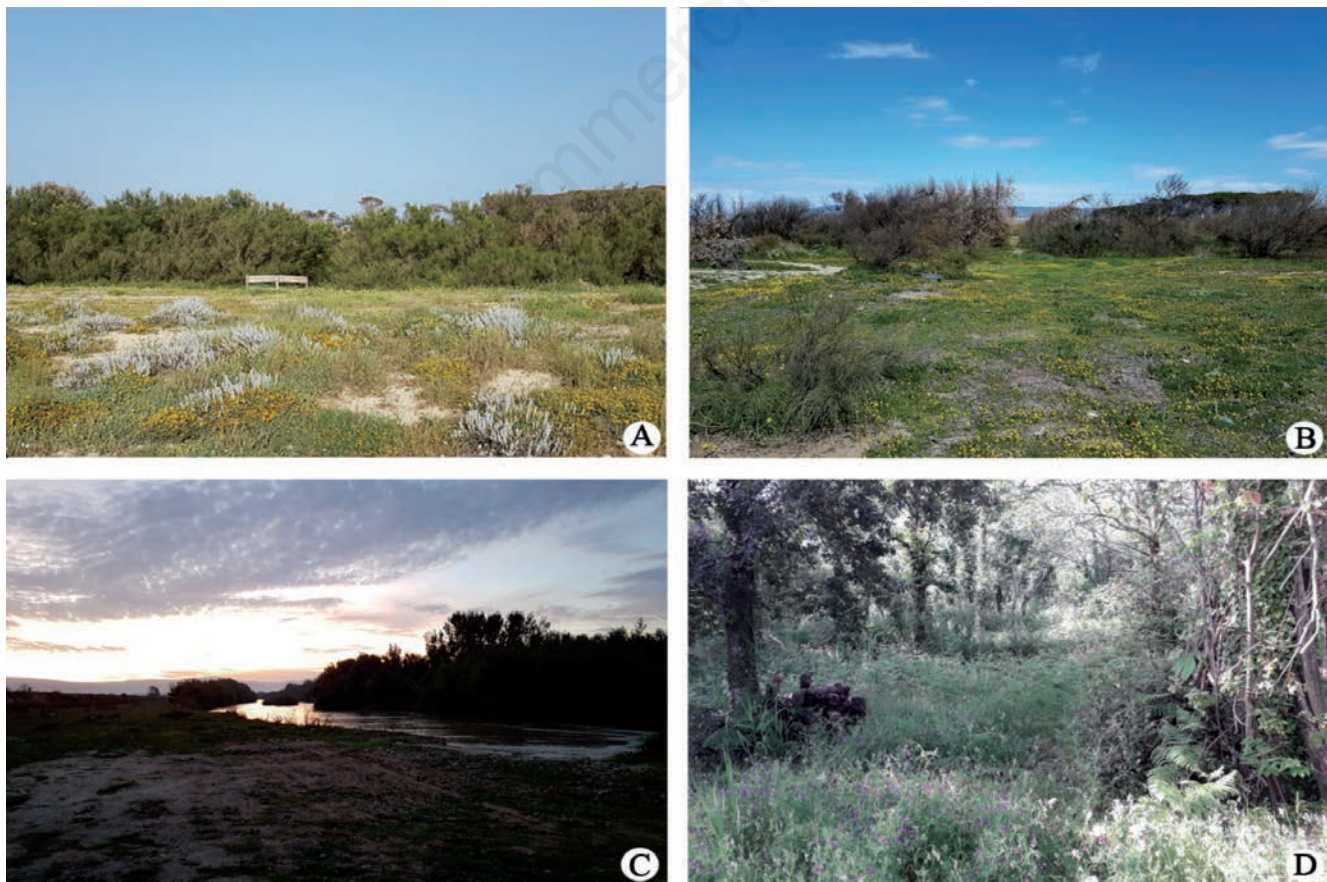
Figure 2. Habitat of the four sampled sites; A: dunal vegetation; B: retrodunal vegetation; C: riparian habitat; D: chestnut woodlot.

Fifteen specimens were submitted to DNA barcoding, a technique based on the analysis of a 658 bp sequence of the mitochondrial gene COI-1, largely used for species identification (Hajibabaei et al. , 2006). Samples were prepared according to the protocol of the Canadian Center of DNA Barcoding, where samples were barcoded. Sequences are stored in the Barcoding of Life Database (BOLD) and compared to the other available in the database in order to confirm their correct identification, allowing us also to search for genetically isolated populations (Table 2).